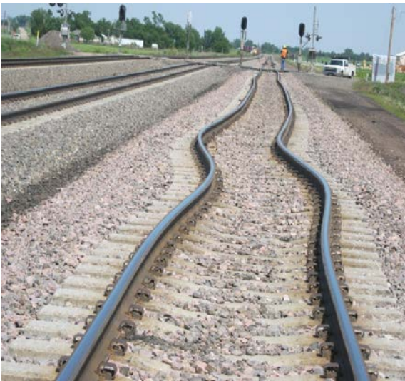
Figure 1. Example of a Track Buckle, sometimes referred to as “sun kink”

Preventing track buckling incidents (Figure 1) is important to the railroad industry. Track materials, rail steel, for example, experience thermal expansion, which refers to the increase in a material's volume as its temperature rises. Thermal expansion can affect the stability of the railroad track structure by causing a longitudinal force to develop along the rail. If this force becomes too great, and lateral restraint from the rail fasteners and ballast is weak, a track buckle can occur. It is common practice for railroads to impose localized or territory-specific slow orders on days with high ambient temperatures since the risk of track buckling is potentially greater on those days.