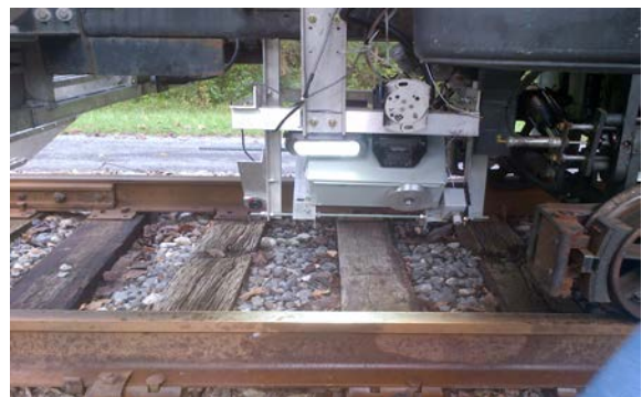
Figure 4. NCRTM Sensor Mounted Under R-4

The lab test results showed good correlation between the thermocouple data and the NCRTM sensor data. Therefore, continued development and refinement of the sensor occurred from 2010 to 2012 under a Phase 2 SBIR contract. The first field test of the NCRTM sensor was performed in the summer of 2011. A second field test was conducted in the summer of 2012 using FRA’s R-4 hi-rail research platform (Figure 4). This field test compared the NCRTM sensor with two commercial, non-contact sensors, as well as with 25 “ground truth” thermocouple sensors placed on the rail throughout the 3-mile test zone.