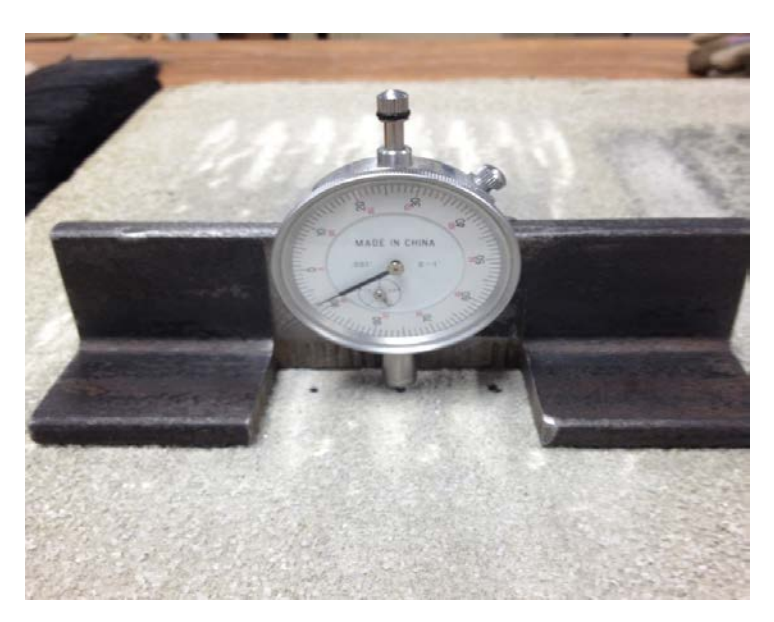
Figure 3: Gouge depth measurements.