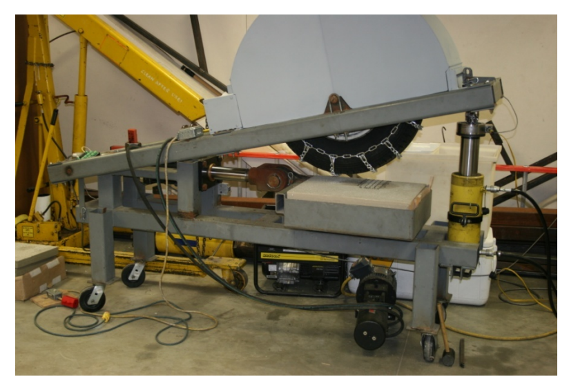
Figure 2: Traction and chain-wear test equipment.

work with the data collector to allow for calibration and corrected readings. The apparatus is approximately 23.62 in. (60 cm) wide and 90.55 in. (230 cm) long and weighs around 4,500 lb (20 kN). The tray of the test machine is 18 in. (45 cm) wide by 24 in. (61 cm) long by 5.91 in. (15 cm) thick. Figure 2 is a picture of the traction chain-wear test equipment.