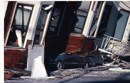
1989, Loma Prieto, California, earthquake destroys an apartment building, which collapses on an automobile

Exactly one month after Hurricane Hugo hit the Virgin Islands, an earthquake registering 7.1 on the Richter scale shook northern California, damaging runways, disrupting airline service, and causing approximately $50 million damage to FAA facilities and equipment. The affected facilities included the San Francisco tower cab, which lost windows and its ceiling, and the San Jose tower, which lost a window and air conditioning unit. Despite the damage, controllers remained on duty to ensure the safety of flights aloft.