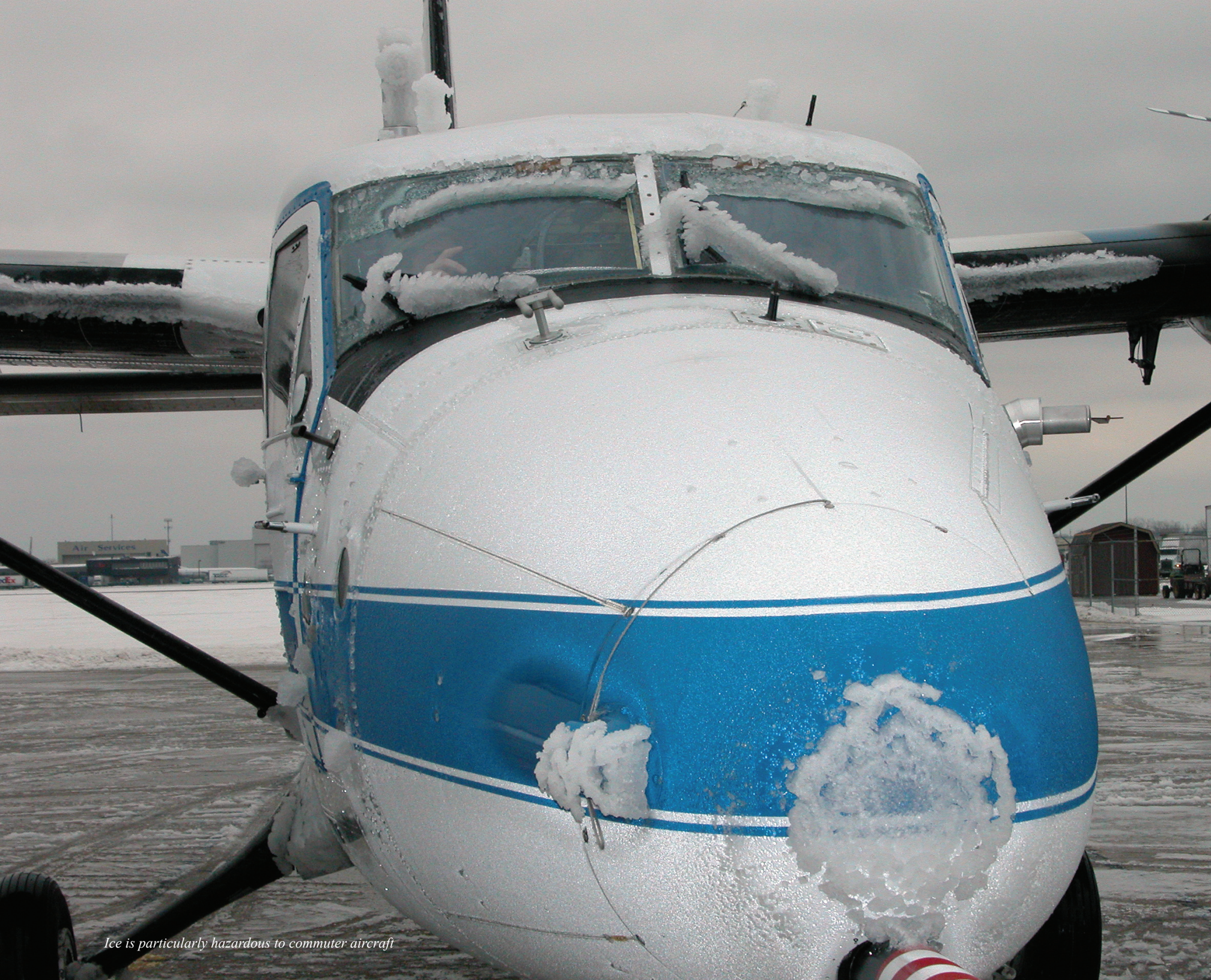
Ice is particularly hazardous to commuter aircraft