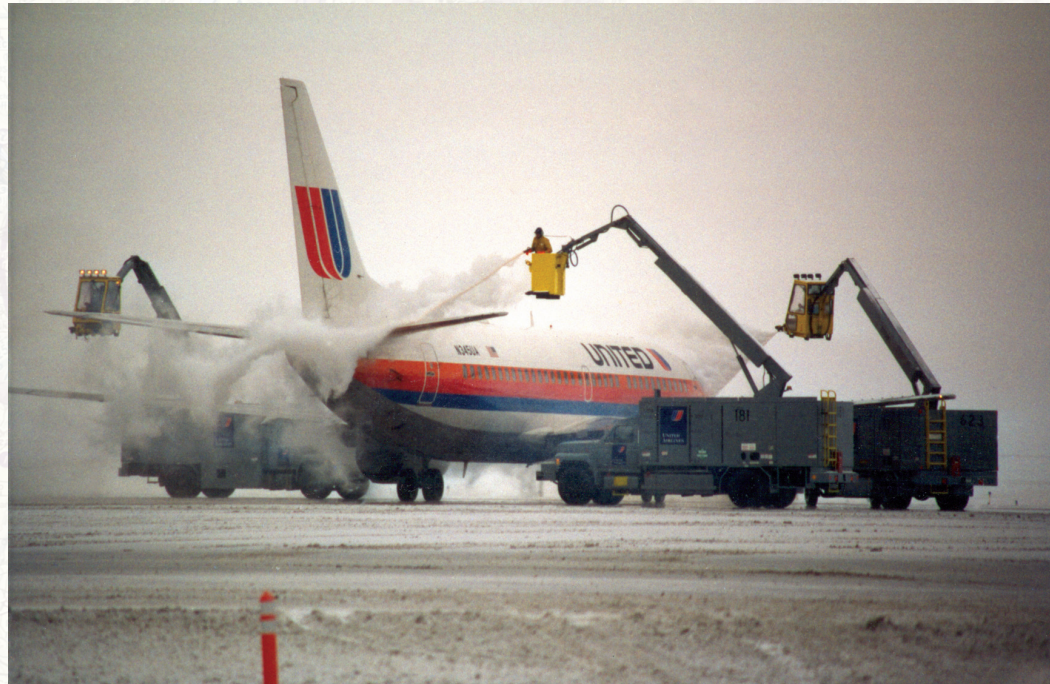
New aircraft deicing rules improve safety

The conference reflected global concern about icing and produced a series of recommendations for combating this hazard. On September 25 FAA announced a requirement for airlines using large aircraft (Part 121) to have an approved ground de-icing/anti-icing program in place by November 1, 1992. On December 29, 1993, FAA announced stronger deicing requirements for commuter and air taxi pilots to check aircraft surfaces before taking off in adverse weather. The agency also mandated certain new training and checking requirements for pilots for commuter aircraft and larger private planes.