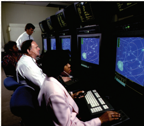
Modernization of ARTCCs help controllers meet growing demand for service

The advanced automation program FAA began in the early 1980s, was a key program in the new transportation policy. Under this ambitious development and acquisition program, FAA set out