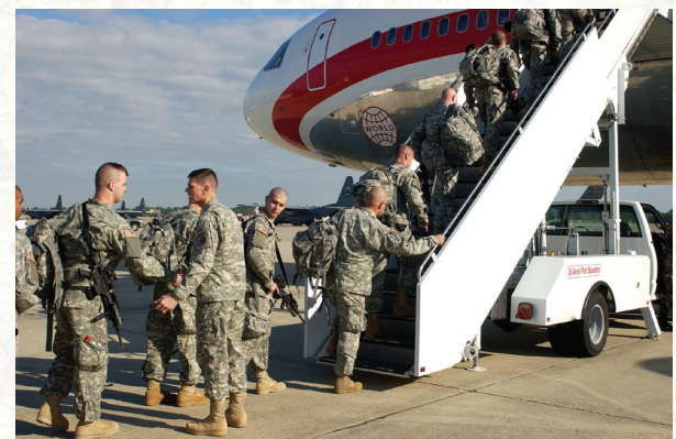
Civil Reserve Air Fleet aircraft transports soldiers

To speed the movement of increasingly large numbers of U.S. troops to the Middle East, for the first time in history, the Department of Defense (DoD) activated the Civil Reserve Air Fleet (CRAF) on August 17, 1990. Comprised