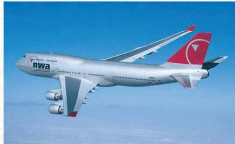
Open Skies agreements facilitate global partnerships

On March 31, 1992, DOT announced the United States would explore aviation agreements with all European countries willing to allow free access to their markets. In the past, the United States had offered such agreements to only a few of its largest aviation partners.