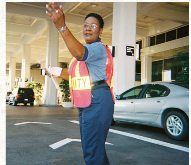
Tightened airport security results from the Pan Am 103 bombing

In the aftermath of the December 1988 Pan American Flight 103 bombing, FAA instituted a number of measures designed to prevent future acts of terrorism. In March 1990 FAA assigned its first