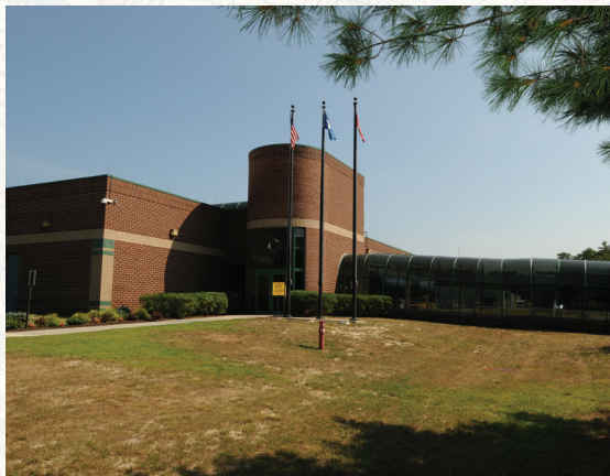
1993, FAA aviation security laboratory opens