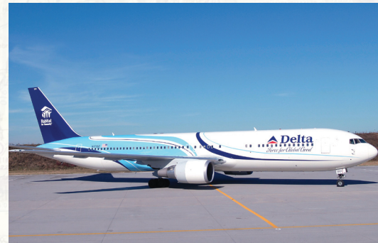
Many airlines form global partnerships

January 11, 1993, DOT gave Northwest and KLM immunity from antitrust laws so they could operate as one airline. The trend toward greater collaboration with foreign carriers was further illustrated