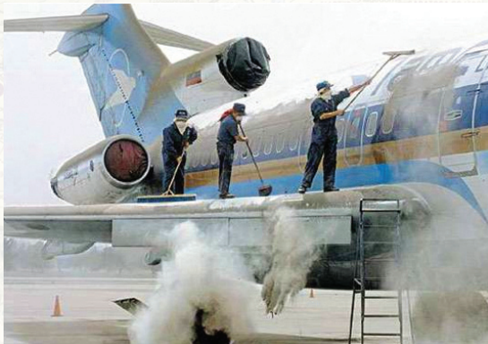
Workers clean volcanic ash from an aircraft

Another volcano erupted on June 15, 1991. Ash from Mt. Pinatuba damaged airports within the Philippines and emitted a huge cloud that disrupted aircraft operations over a wide area. Ash damaged