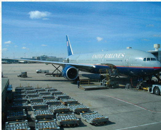
United codeshares with Lufthansa

In response to the announcement, Northwest Airlines and KLM Royal Dutch Airlines agreed to create what they called “a unified global airlines system.” Although KLM already had a 20 percent stake in Northwest, the agreement enabled the two carriers to integrate their operations worldwide. On