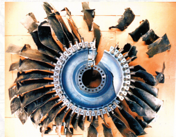
Example of damage to rotating engine parts

A July 1989 crash highlighted the need for careful inspection of rotating engine parts. After debris from a failed engine damaged its control system, a United Airlines DC-10 crashed while attempting an emergency landing in Sioux City, Iowa, killing 110 of the 296 people on board. Preliminary investigation of the accident indicated that one of the two titanium disks holding the engine’s fan blades had separated, either intact or in fragments, from the rest of the engine. FAA moved quickly to find a way to prevent the recurrence of this type of accident. On August 3 the agency announced formation of an agency/industry task force on improving aircraft survivability following major in-flight