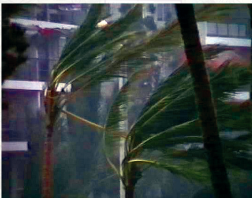
Hurricane Hugo winds

While FAA officials worked together with their colleagues at DOT to increase international safety and security, a number of natural disasters immediately commanded the agency's attention.