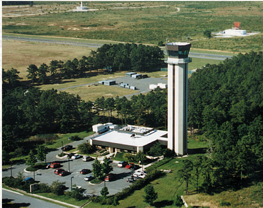
1980s, modernization of air traffic control facilities begins

FAA continued to address a variety of technical issues and pursue its strategic goal to modernize the air traffic control system during the Bush Administration. Acquisition and deployment of new technologies designed to automate the air traffic system, enhance capacity, and improve safety kept pace with the rapid evolution of aeronautics. The agency worked steadily to connect airplanes by radio and satellite link to a global information system that could