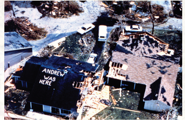
Hurricane Andrew damage

installations experienced significant damage, power loss, and outages. By the following day, however, Miami, Key West, West Palm Beach, and Fort Lauderdale Executive airports reopened. The hurricane moved into Louisiana on August 26. During the height of the storm, most FAA facilities in the affected part of that state shut down or were placed on standby status, and several airports were temporarily closed.