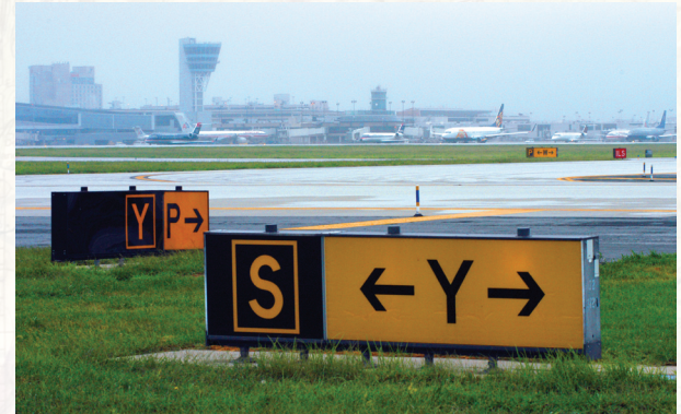
Runway incursion prevention includes airport signs

announced a runway incursion plan that would test advances in runway marking, lighting, and signs at the Boston, Seattle-Tacoma, and Pittsburgh airports, and the new Denver