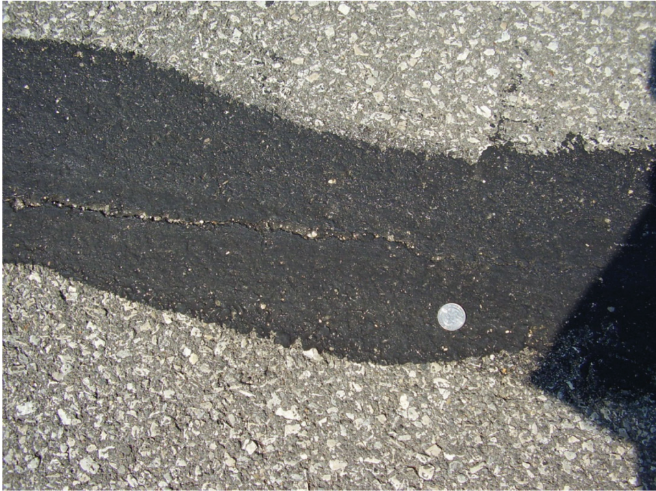
Figure B.15 SR23 double tack.