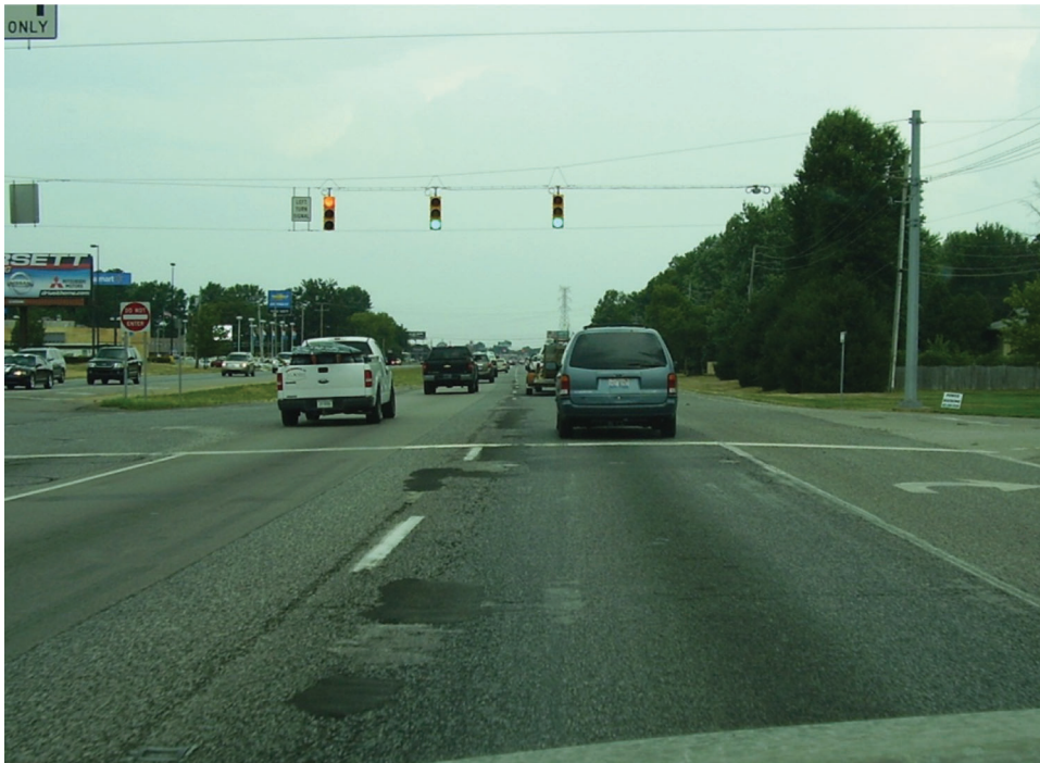
Figure B.13 Deterioration at and beyond joint, US41.