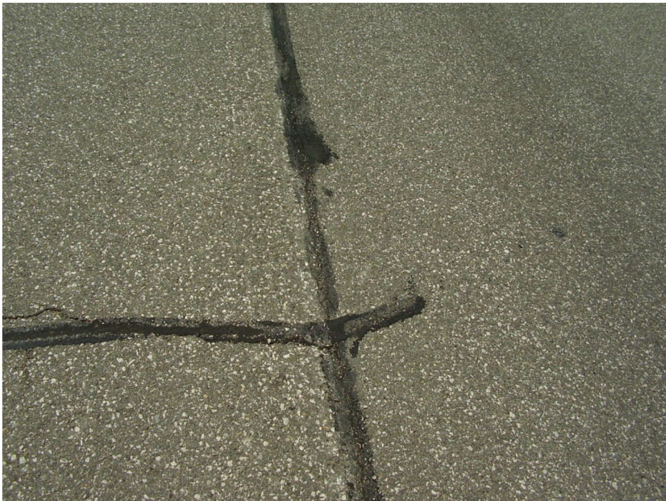
Figure B.20 Condition of test section 3 (SAMI), SR23.