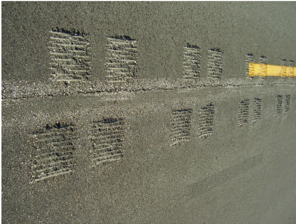
Figure B.34 Another part of SR35 showing joint separation (test section 2).