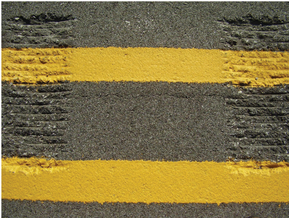
Figure B.22 Joint on SR38 showing slight separation.