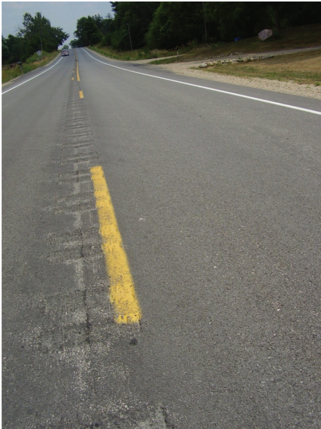
Figure B.29 General condition of SR120.