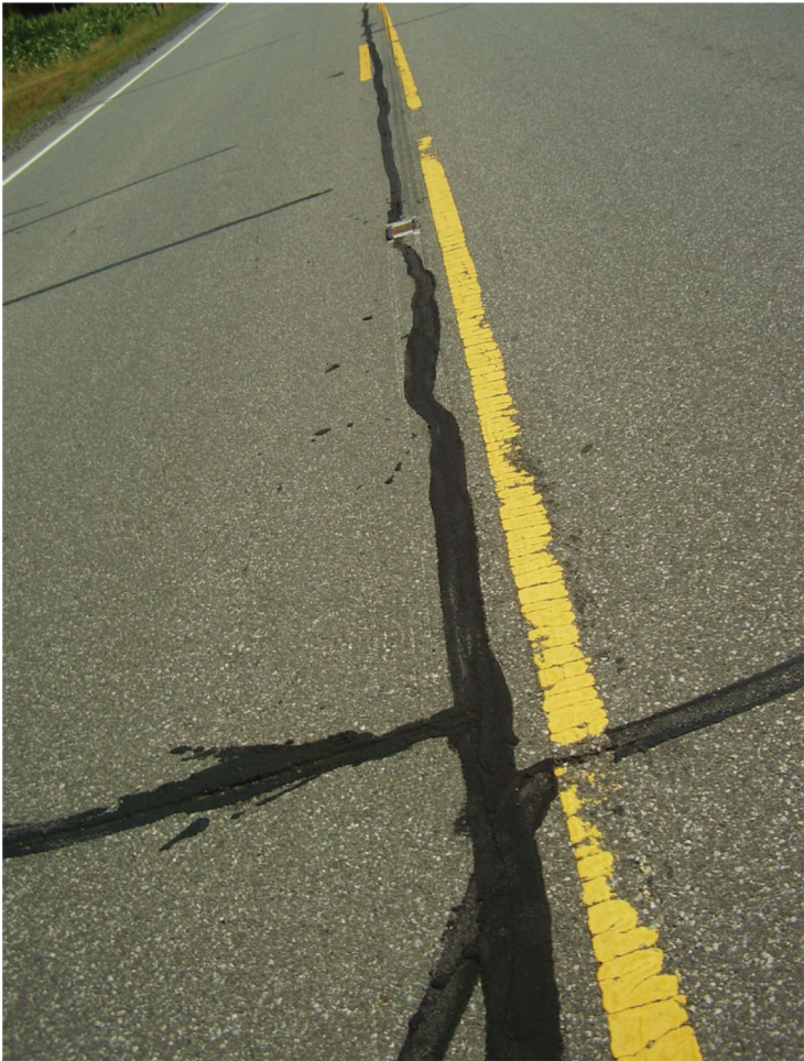
Figure B.18 General condition, test section 2 (fiber membrane).