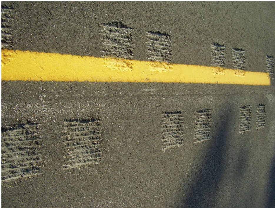
Figure B.32 Tight joint on US35 (test section 1).