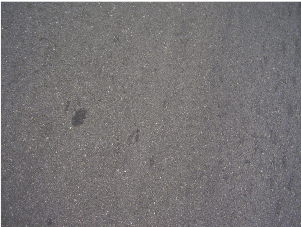
Figure B.9 US40 eastbound—can you see the joint?