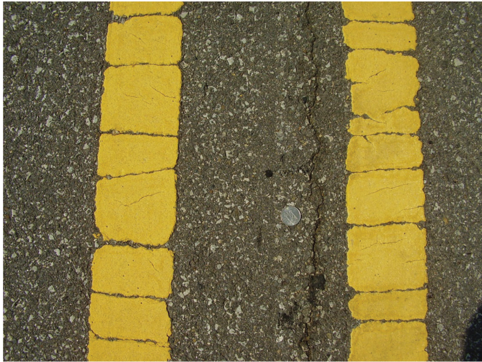
Figure B.21 Area with unsealed joint in test section 3, SR23.