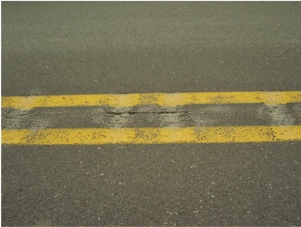
Figure B.27 Joint seal and corrugations, SR120.