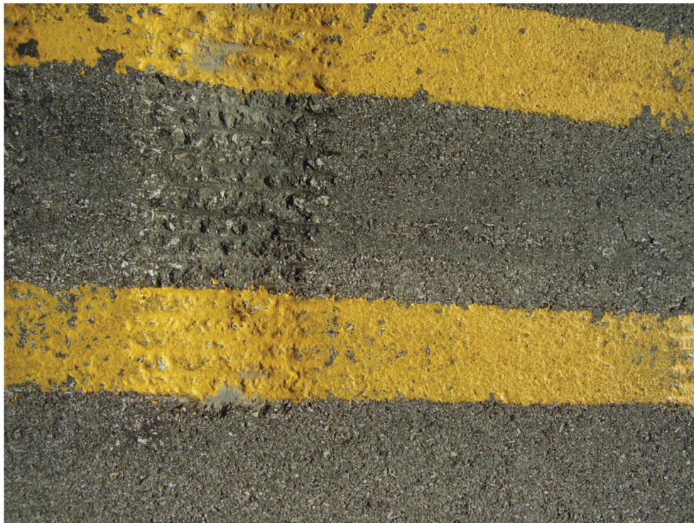
Figure B.26 Joint on SR38, adhesive visible in corrugation.