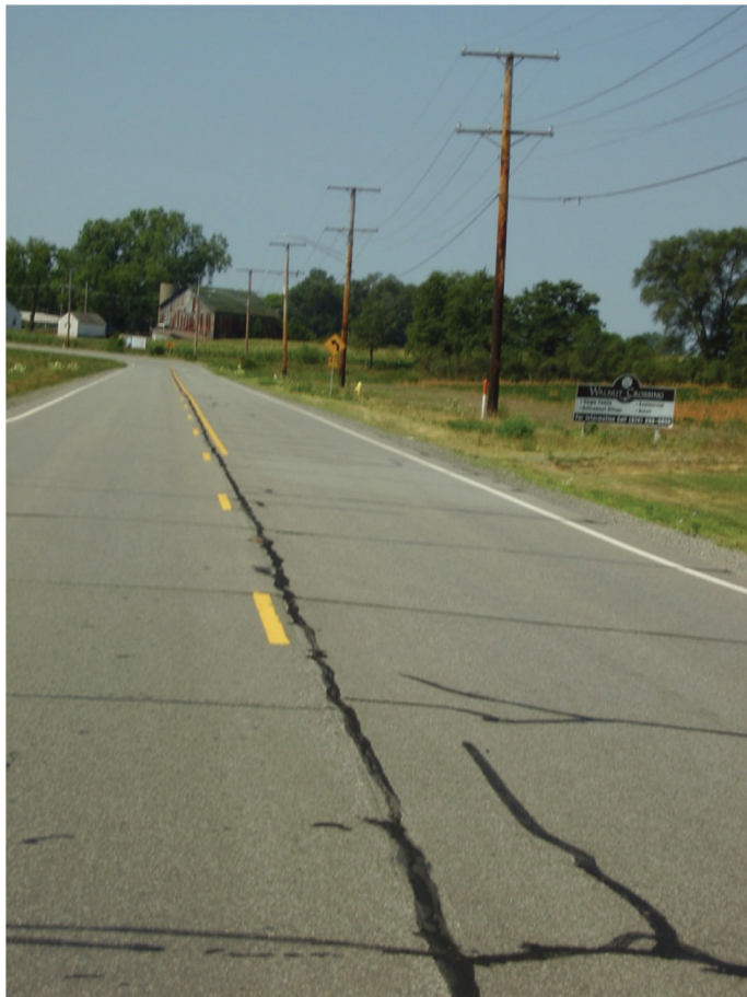
Figure B.16 General condition of SR23, test section 1 (conventional mill and fill).