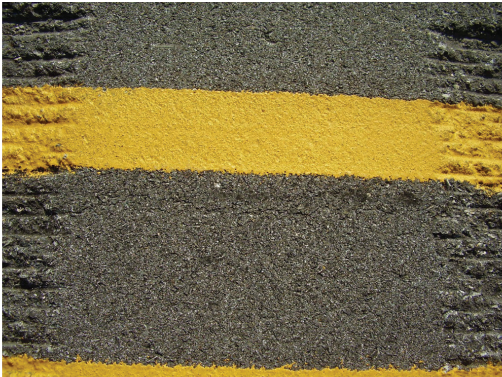
Figure B.24 Close up of SR38 showing what appears to be crack next to adhesive.