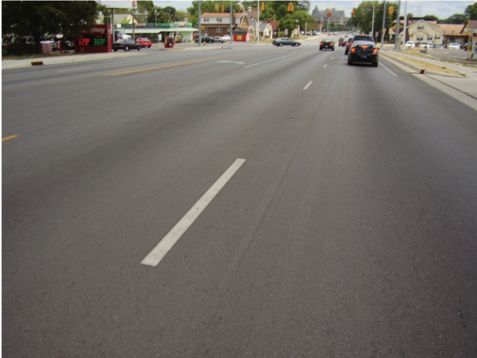
Figure B.12 US40 eastbound—note location of joint approaching wheelpath.