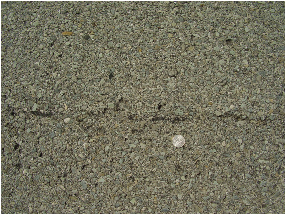
Figure B.2 Joint adhesive visible on surface, I64 westbound.