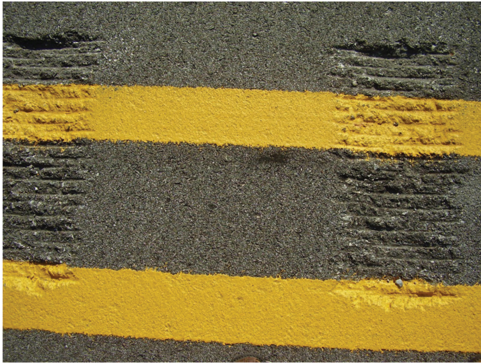
Figure B.25 Another site on SR38 with tighter joint.