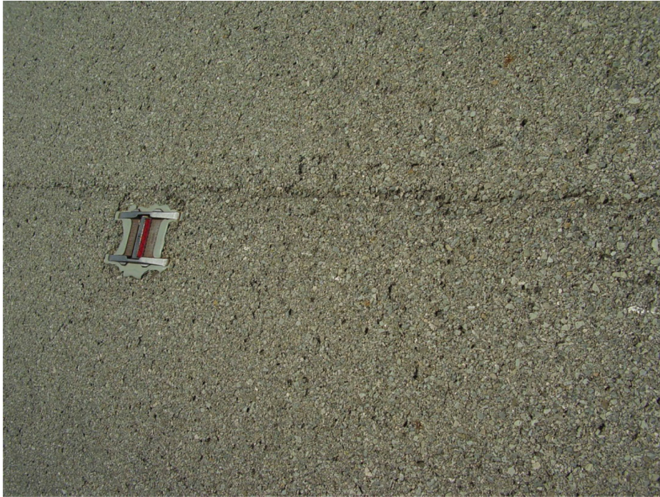
Figure B.3 Some joint separation, I64.