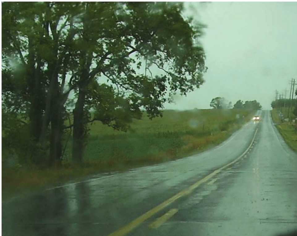
Figure B.7 US231 south of Crawfordsville showing water absorption near centerline joint.