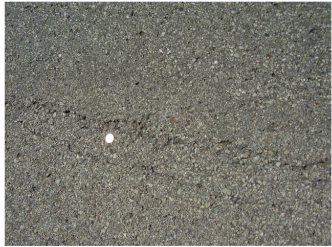
Figure 1.1 Joint deterioration often starts with separation then cracking around the joint.

A great deal of attention has been paid to longitudinal joints over the last five decades. The first report on longitudinal joint issues is apparently a 1964 Highway Research Board publication (3). These authors were the first to document in print that the