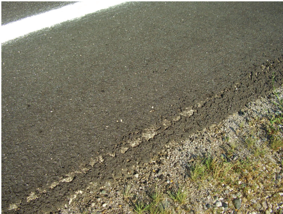
Figure B.36 Photo illustrating edge sloughing (although this roadway has been sealed, this shows what sloughing looks like), SR39.