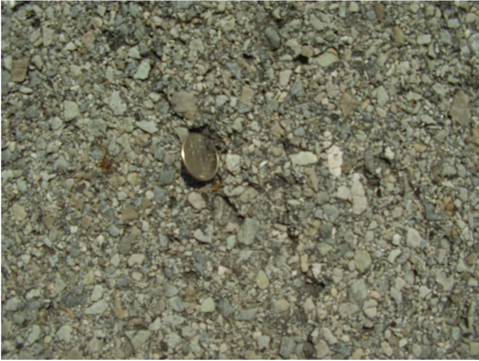
Figure B.8 One of the worst cracks observed, I64 westbound.