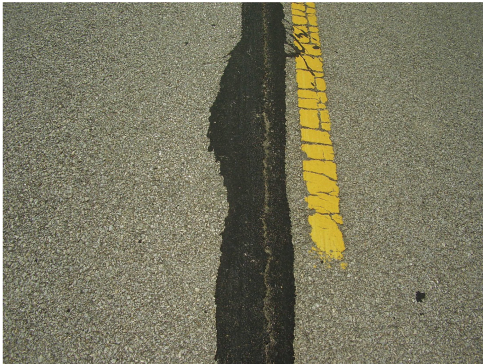
Figure B.30 Condition of SR120 east of test section—separated joint has been sealed.