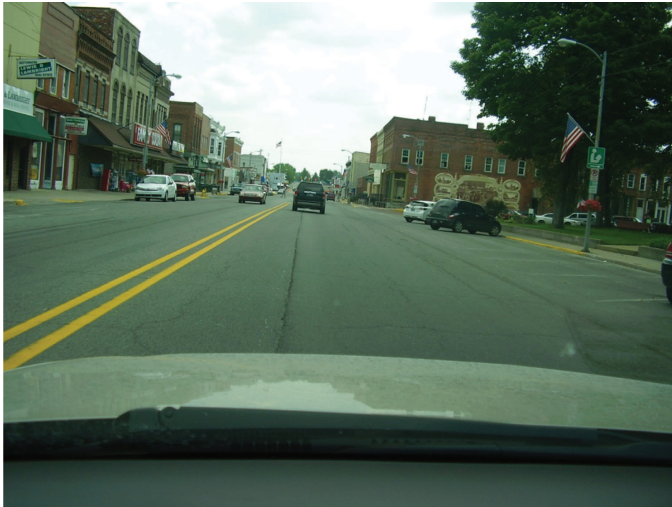
Figure B.35 SR9 in LaGrange showing poor joint placement.