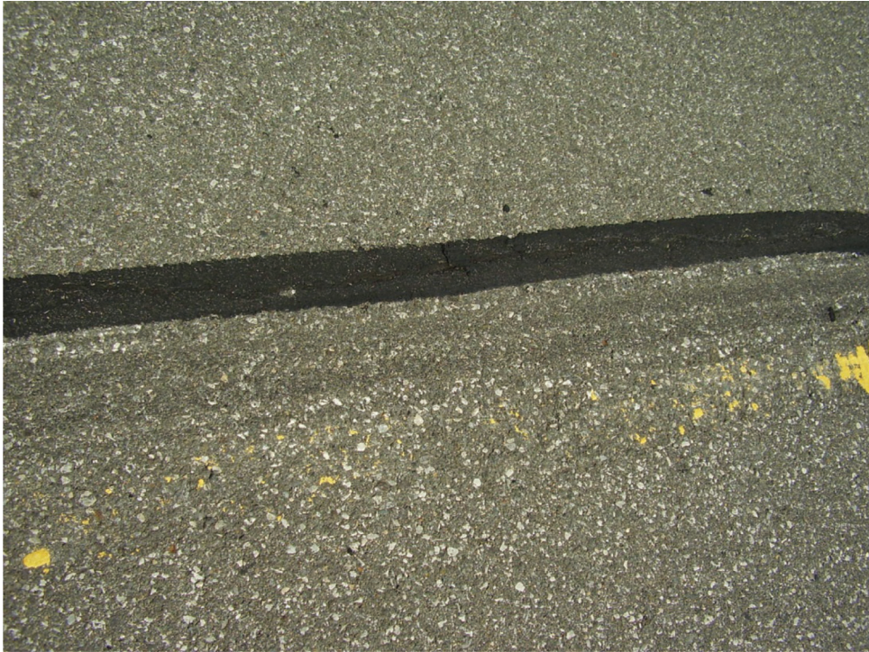
Figure B.19 Joint in test section 2 (fiber membrane), SR23.