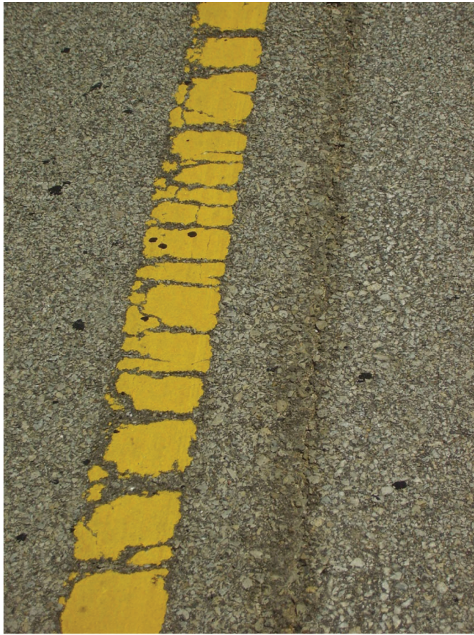
Figure B.31 Another location on SR120 east of test section—joint has not been sealed, staining suggests water intrusion.