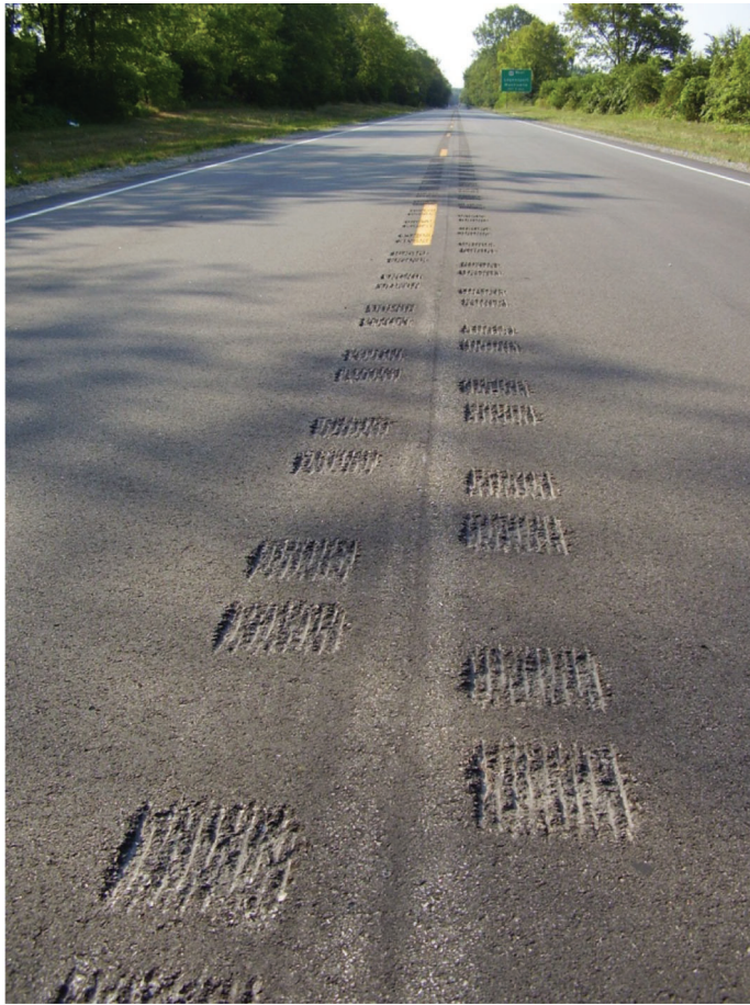
Figure B.33 View of SR35 (test section 1).