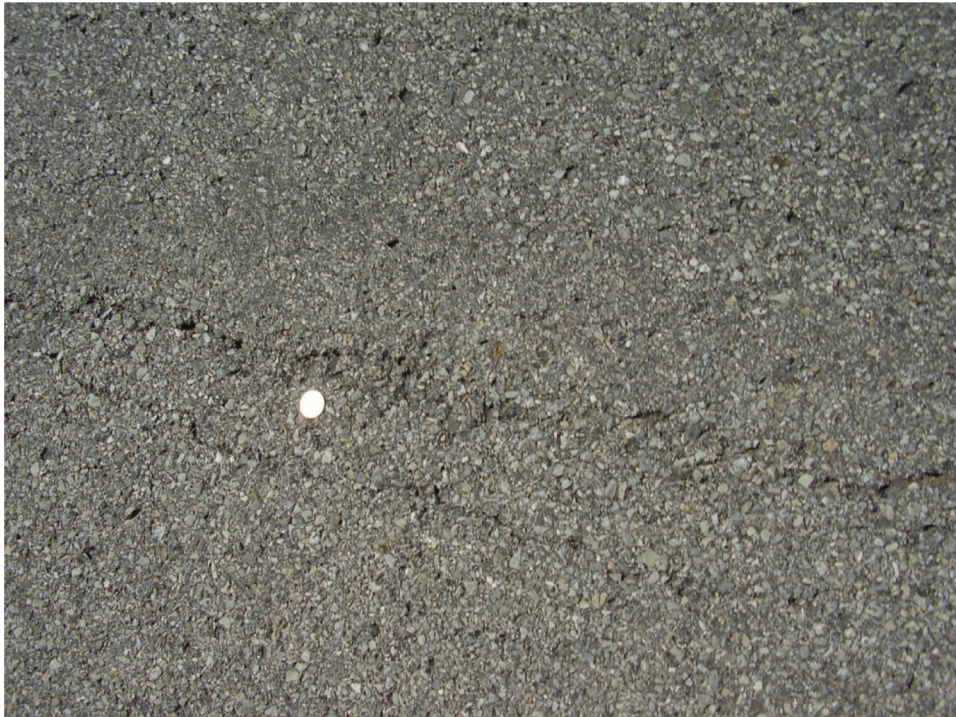
Figure B.4 Cracking and braiding on I64 westbound centerline.