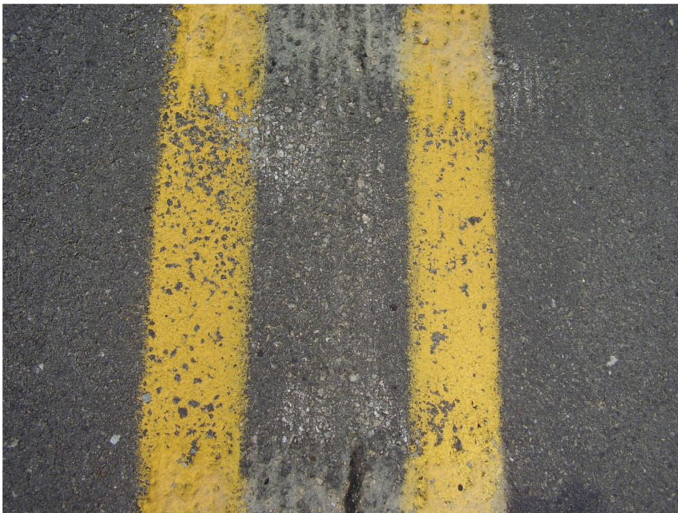
Figure B.28 Joint adhesive and corrugations, SR120—adhesive visible near bottom of photo.