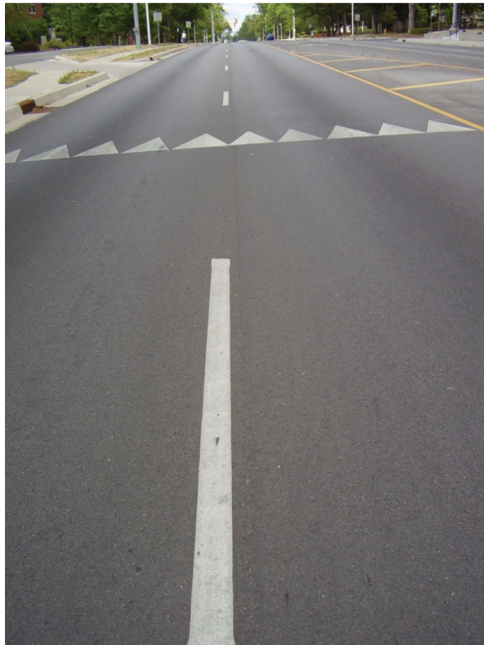
Figure B.11 US40 eastbound lanes (looking west).