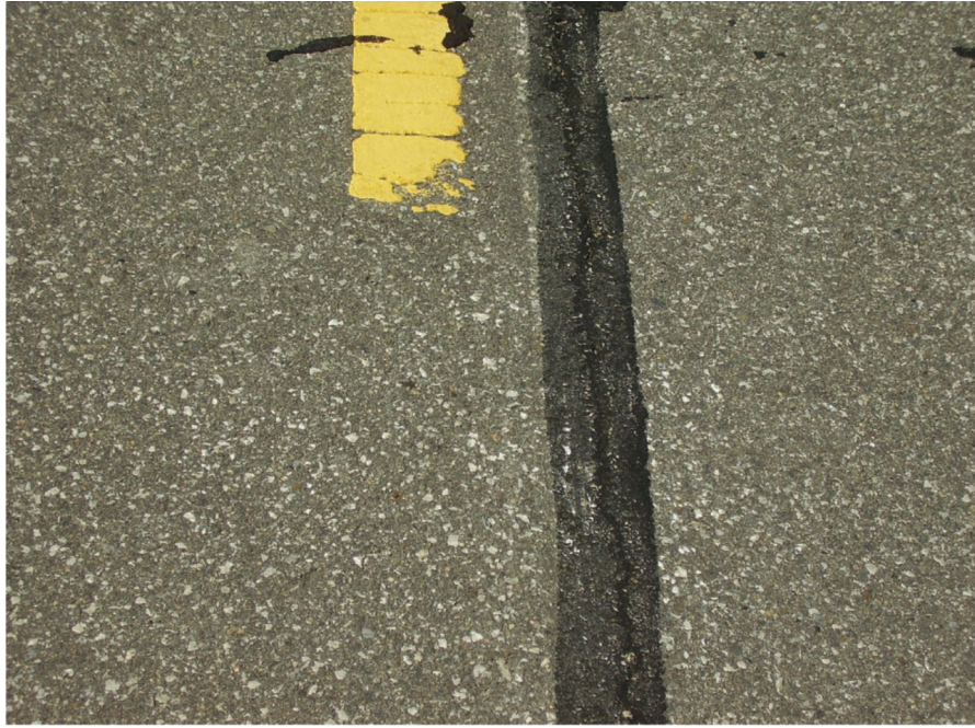
Figure B.17 SR23 joint adhesive (test section 1)—has been sealed.