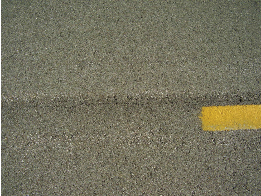
Figure B.23 Slight cracking at joint, SR38.