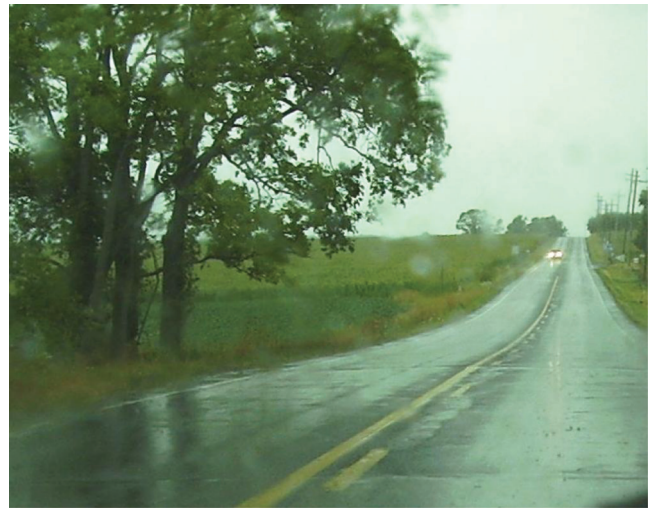
Figure 1.2 Low density material around the joint can allow for the ingress of water and air.

It is also acknowledged that the best way to prevent longitudinal joint distress is not to construct longitudinal joints in the first place (1,4). This can be accomplished by paving in echelon, which means one paver follows a few meters behind another paver, placing adjacent lanes at nearly the same time (1,4,5). In this situation, hot material is placed on both sides of the would-be joint and the material can be compacted into a virtually monolithic layer. Another option is so-called tandem paving, which also uses two pavers, but they