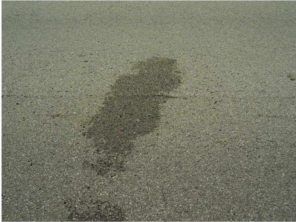
Figure B.6 Water not penetrating surface after 15 minutes, I64 westbound.