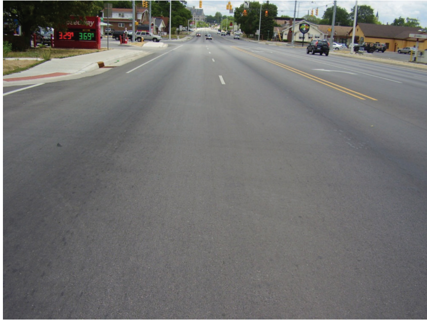
Figure B.10 US40 westbound lanes (looking east).