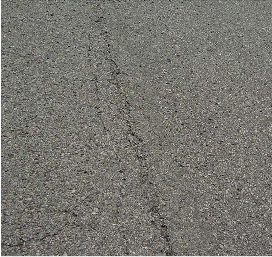
Figure B.5 Cracking at shoulder joint, I64 westbound.