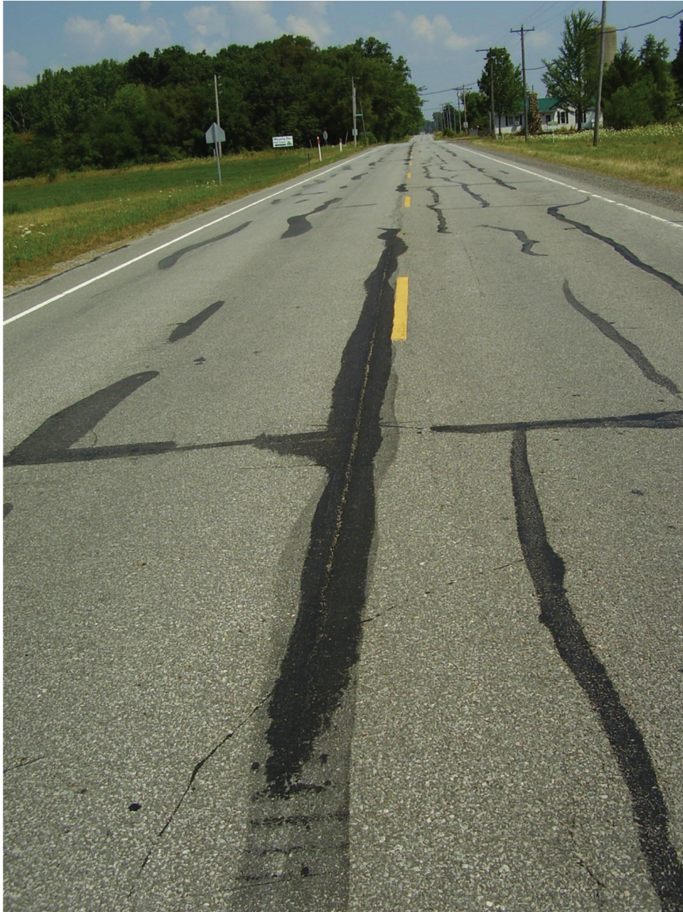
Figure B.14 SR23 double tack—separation at joint.