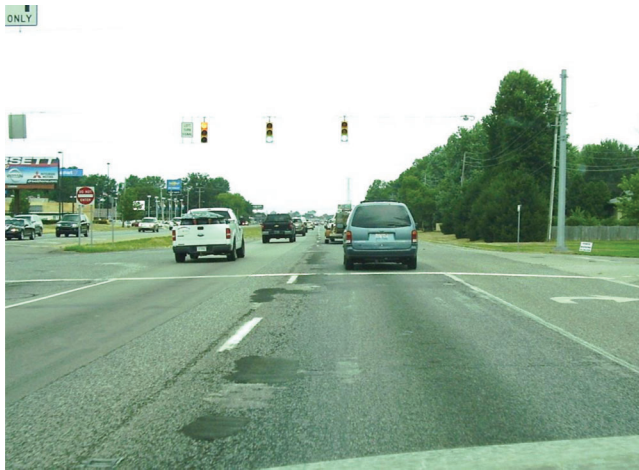
Figure 1.3 Joint deterioration continues and extends further into the mat.

are separated a little further apart, which can allow traffic to travel on the first lane paved (4). (These options will be discussed in Chapter 2.)