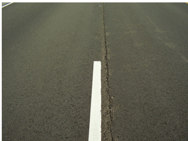
Figure 2.1 Open joint in newly constructed roadway in Indiana, 2012.

adhesive and the eastbound control section without adhesive are performing well. Monitoring the performance of the joints on this project to compare joints with and without adhesive could help to guide future refinements to the joint construction requirements.