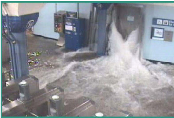
▲ Hoboken PATH Station Flooding.

Due to serious damage, it took much longer for PATH trains to resume service. Partial PATH service began again on Tuesday, November 6. 42 Several stations still remain closed at the time of writing, and will likely remain closed for a considerable time due to flooding and damage to both tunnels and rolling stock. PATH continues to work to restore service. The Port Authority reopened the Holland Tunnel at first exclusively to buses on Friday, November 2, and then to all commuter traffic on Wednesday, November 7. 43,44