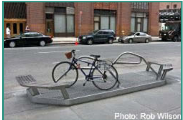
▲ Raised ventilation grate and bike rack.

MTA also developed operational strategies, including plans for pre-deploying portable pumps and personnel when storm conditions threatened to flood. Customer communications were improved with a re-designed MTA website, new e-mail and text message alerts, and installing cellular service and Wi-Fi to subway platforms (still in progress). Lastly, steps were taken to improve communications between operations centers and field personnel.