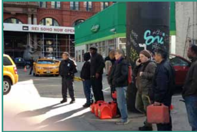
▲ Police Regulate Gas Lines.

The NYPD and other local law enforcement agencies were also critical in maintaining order at gas stations during shortages. When gas lines were at their peak, fights broke out throughout the region. Police were called in and made arrests. Eventually, police officers were placed at every gas station in the city to prevent fighting and regulate orderly lines. 41