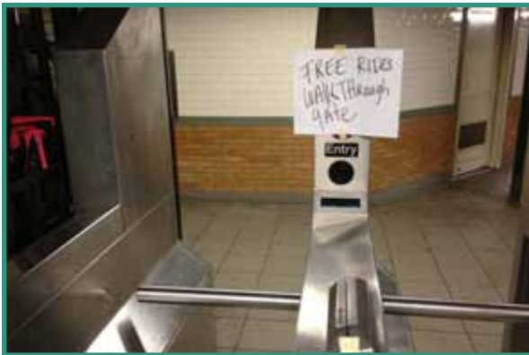
▲ Subway Rides Free in the Days After the Storm.

On Wednesday, October 31, Governor Cuomo and the MTA announced that subway service would resume the following day, primarily north of 42nd Street in Manhattan and into the Bronx, east of downtown Brooklyn and Williamsburg, and in parts of Queens. The F and N trains (between Manhattan and Queens) were the only trains crossing the East River, which created massive crowding issues. Limited Metro-North service between Grand Central and White Plains began, and limited Long Island Railroad service between Jamaica Station and Penn Station and Atlantic Terminal resumed as well. 17 The MTA worked tirelessly to get the system back in order, opening lines as they became ready and power was restored.