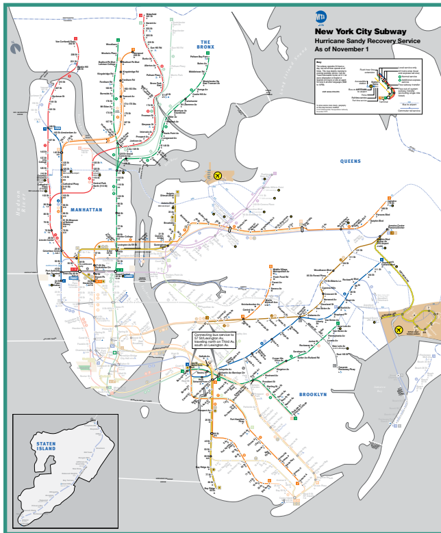
▲ MTA Subway Recovery Map, November 1, 2012.

in the Hugh L. Carey Tunnel in the Manhattan-bound tube. On Tuesday, November 13, the tube was opened to car traffic as well, with one lane for buses and one for cars. 25