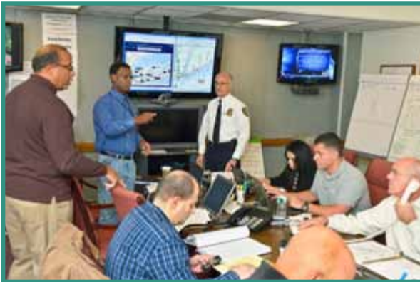
▲ MTA Emergency Response Room.

Public agencies throughout the New York metropolitan region actively prepared for Hurricane Sandy. Coordination efforts among municipal agencies were systematic and strong. The New York City Office of Emergency Management (OEM) convened an October 24 coastal storm steering committee, including