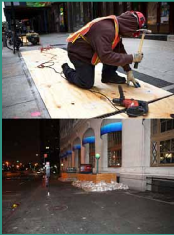
▲ MTA worker covering subway ventilation grate, above; and the Bowling Green 4/5 station, below.