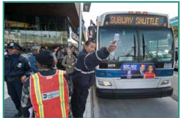
▲ Loading Buses at Atlantic Avenue.

You had issues everywhere, you had no subways coming across from Brooklyn to Manhattan, so we needed to set up a new surface subway system. We worked with the MTA—we’d set up the bridges, so why not some bus bridges?—and the NYPD got their people out there to enforce that. 28