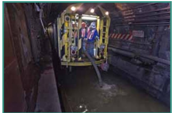
▲ Subway Pump Trains.

The subway system was severely affected by the flooding of its tunnels. MTA employees used their three pump trains to remove water from the tunnels as soon as possible. 13 They received some aid from the "unwatering team" of the Army Corp of Engineers, but most of the pumping was done by MTA. Workers put in double shifts on consecutive days to get the pumping done. The subway does have its own pump system for normal drainage, but it cannot function without power and therefore could not work during the hurricane. 14