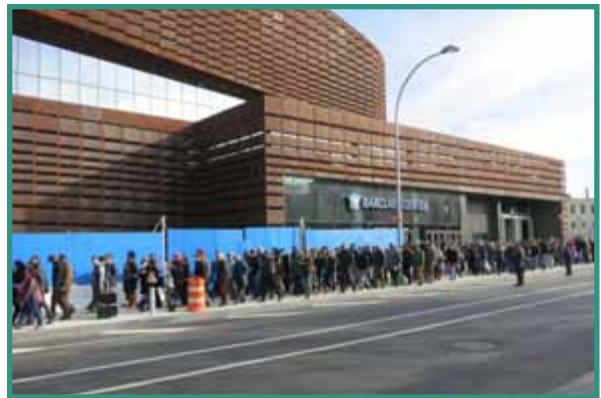
▲ Riders line up for Bus Bridge vehicles to transport them from the Barclays Center in Brooklyn to Midtown Manhattan.

While a major gas shortage and long-term closures of key arteries would have led to a prolonged crisis in a more auto-dependent city, New York was able to leverage alternative modes of transportation, such as biking, walking, and ferries, to get to work efficiently and restore a sense of normalcy even during a "transportation emergency." The recovery process is discussed over the next several pages.