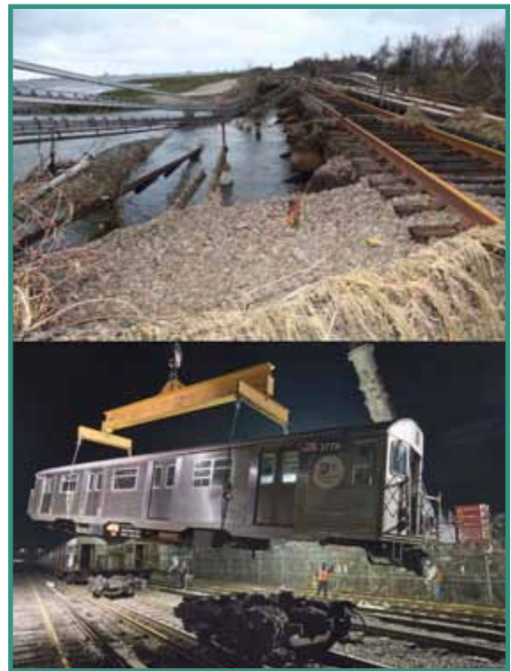
▲ Damaged and debris-strewn A train tracks, above; Transporting subway cars to the Rockaways, below.

To restore transit service within the Rockaways peninsula, the MTA brought subway cars on flatbed trucks and placed them on unused tracks to run a shuttle, the 'H' train, between the Far Rockaway-Mott Ave. and Beach 90th Street stations. From Far Rockaway, riders can take a bus shuttle to Howard Beach to regular A train service. 22 To provide alternative transportation, a ferry service is running between the Rockaways and Manhattan. 23 These transportation developments mark an essential development in providing Rockaways residents with modes to return to work, and removing their isolation from the city.