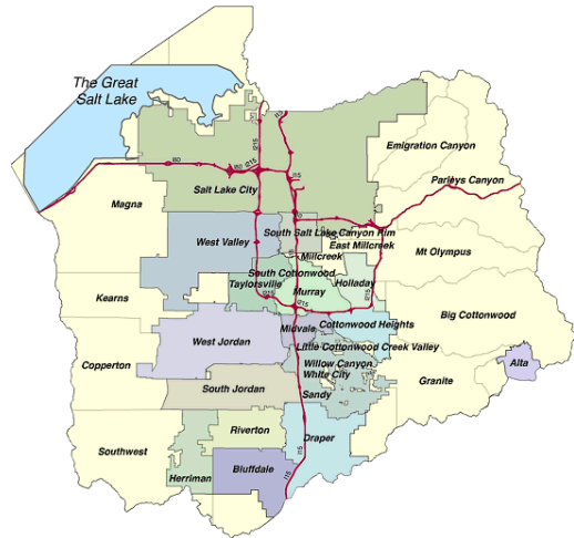
Figure 1. Salt Lake County, Utah

This analysis described in this report takes place in Salt Lake County, Utah. Salt Lake County is centrally located in the heart of the Wasatch Front Metropolitan Region and consists of 16 municipalities and 12 unincorporated county maintained areas/townships (shown in Figure 1 below). 37% of Utah's population resides within the 742 square miles that encompass Salt Lake County, making it by far the most populous and urbanized of all Utah's counties (U.S. Census 2010).