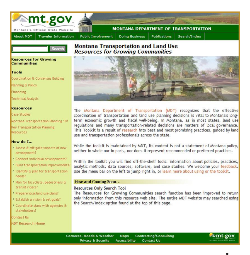
Figure 2. Online Resources Home page

• Implementation activities for the next two years should be led by the MDT Rail, Transit, and Planning Division, with Division leadership