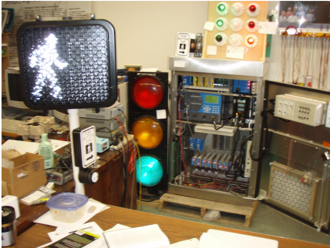
Figure 2: Laboratory equipment representing traffic controls at 6th and Deakin Streets.

We modified commercial MUTCD compliant pedestrian signals [1] and accessible pedestrian stations [2] with network capable commercial low-cost microprocessors [3]. Using existing hardware reduced development costs and allowed us to focus on the development of software independent of hardware that will ultimately employed in field devices.