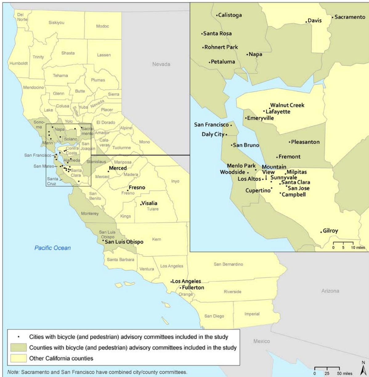
Figure 1. Map of the 42 Committees Included in the Study

In addition, efforts to recruit women were reviewed, and the committee bylaws and other official documents were examined for language about gender and/or the need for diversity.