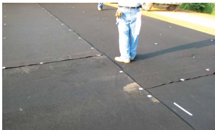
Figure 5. Overlap of nonwoven geotextile material sections

Research is recommended to determine if nonwoven geotextile interlayers prevent reflective distress in concrete overlays when the existing pavement is not rubblized or cracked-and-sealed. This and other ongoing performance questions will