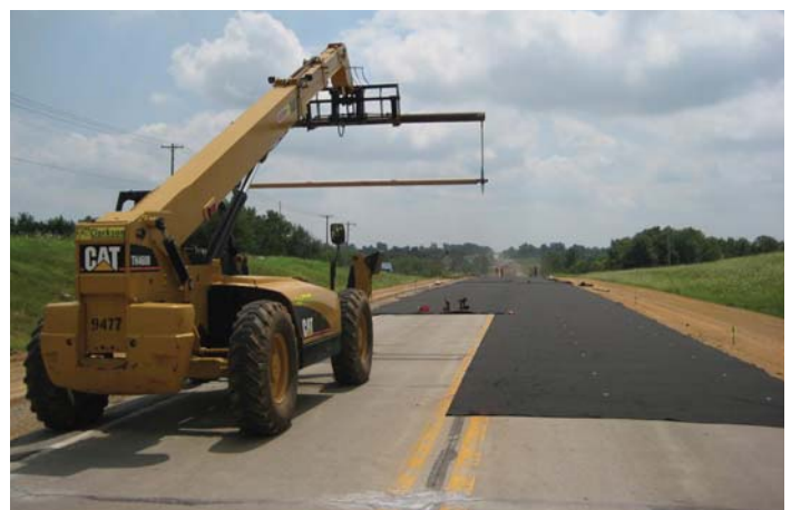
Figure 3. Application of nonwoven geotextile materials