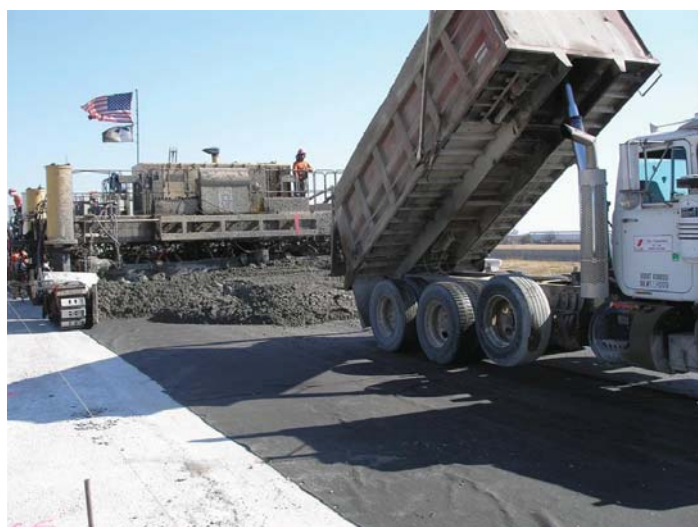
Figure 7. Paving on top of nonwoven geotextile materials

be monitored on the Missouri overlay and other upcoming projects. In addition, research is needed to determine ease of removal of concrete placed on nonwoven geotextile materials.