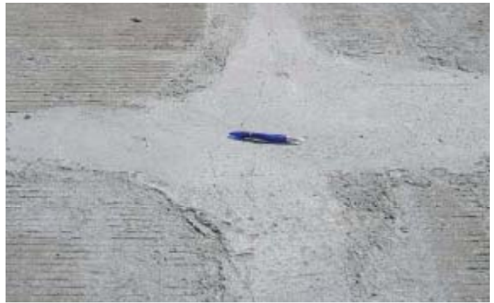
Figure 2. Repair/replacement of damaged concrete with flowable mortar

The galvanized discs used to secure the nonwoven geotextile to the cement-treated base were approximately 1 in. in diameter (smaller than German specifications).