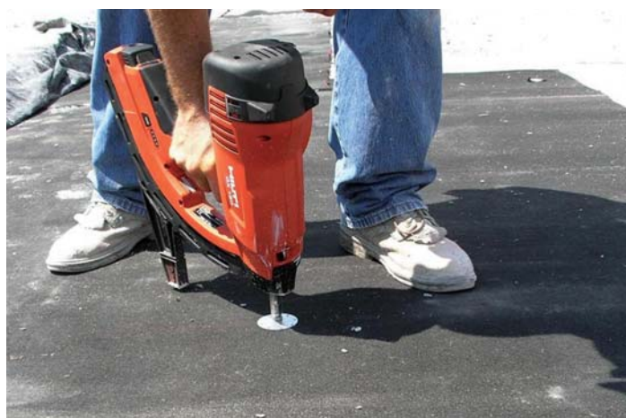
Figure 6. Fastening nonwoven geotextile fabric to existing concrete pavement