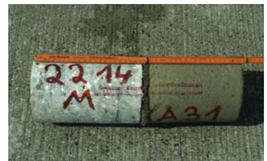
Figure 1. Core from Germany showing nonwoven geotextile interlayer between surface concrete (left) and cement-treated base (right)

German engineers have steadily improved the following characteristics and functions of nonwoven geotextiles for use as interlayer materials: