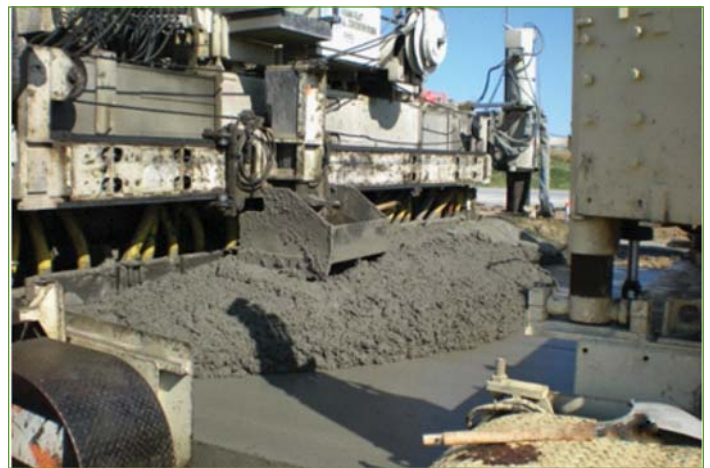
Placement of top lift