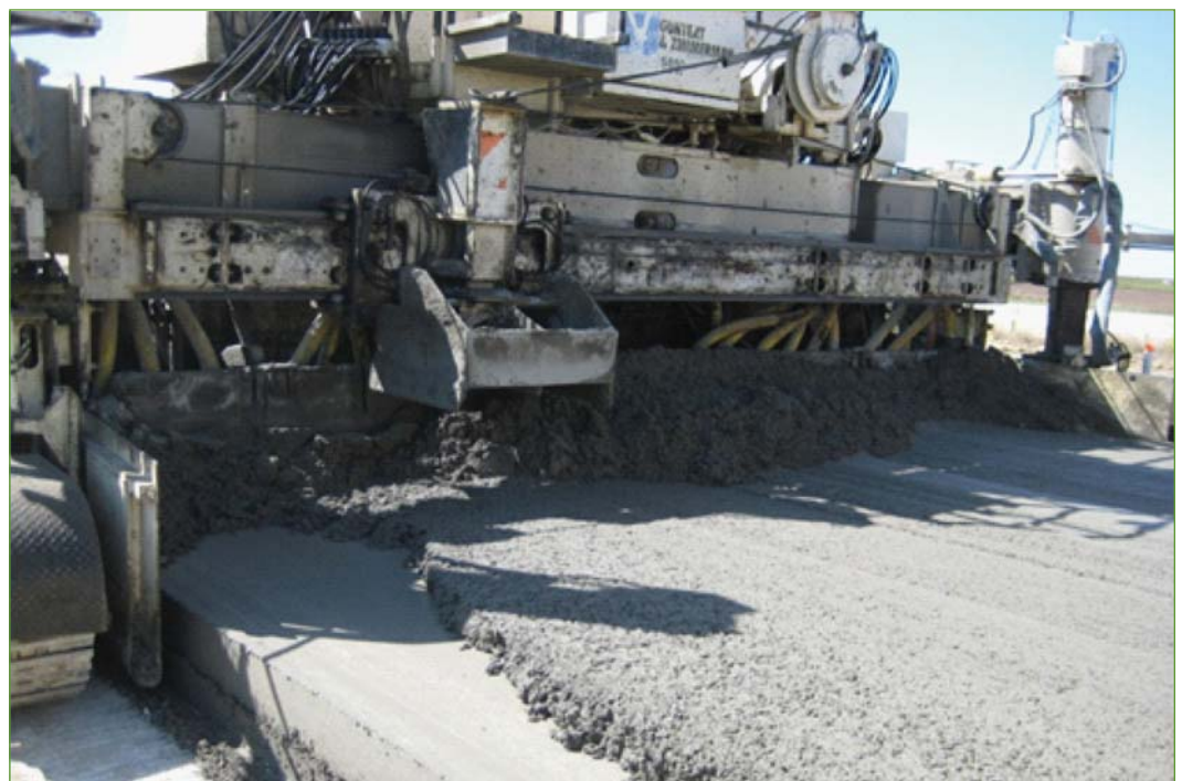
Two-lift paving operation in Saline County, Kansas

However, the high-quality, wear-resistant aggregates used to construct the U.S. concrete pavements that have lasted 50–60 years are becoming scarce. This scarcity of aggregates, combined with advances in materials knowledge and construction equipment and increasing demands for pavement surfaces