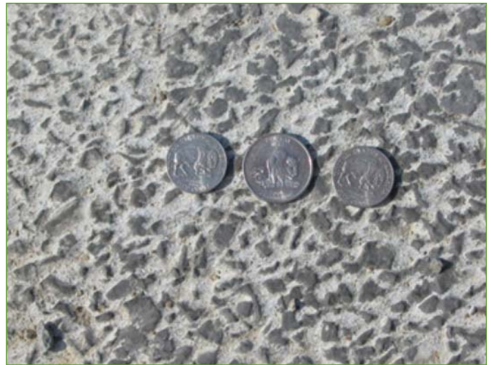
Exposed aggregate surface

As part of this project, the Missouri Department of Transportation will place an innovative section of two-lift concrete