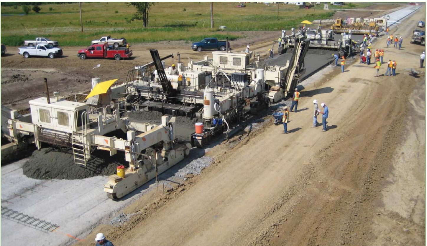
Two-lift paving train