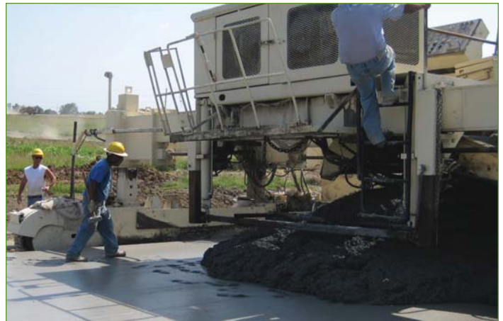
Worker standing on bottom lift while top lift is placed

The concrete for the top lift was then delivered to a second belt placer, with the second paver forming the final pavement profile. The total distance of the paving operation from the first belt placer to the final paver was, on average, less than 45 m (148 ft). In this wet-on-wet application, both the bottom and top lifts were completed in about 30–60 minutes.