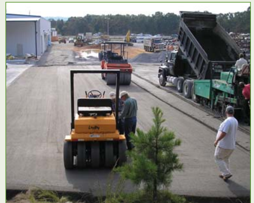
Commercial parking lot