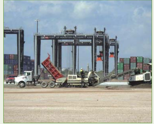
Port terminal, Houston, TX