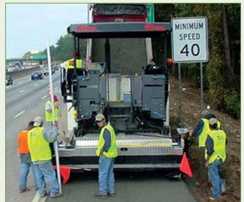
Interstate highway shoulder, Atlanta, GA