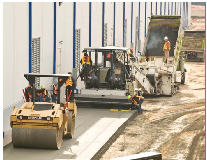
RCC paving train