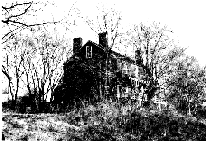
Figure 2. Crossroads Tavern (692 & U.S. 29).

The road today passes many buildings that were there during the original use of the road. Among the extant buildings that served the original road are toll houses and taverns. Three are shown in Figures 2-4. One tavern is located at Cross Roads (on the western side of Route 29); a toll house is at Garland's Store, located at the intersection of Route 712 and Route 631; and another tavern is in Scottsville. A detailed history of the architecture along the road is being compiled by Dr. K. E. Lay, a professor of architecture at the University of Virginia.