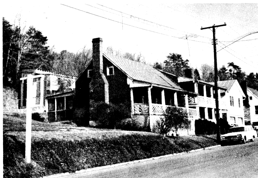
Figure 4. Tavern (Scottsville).