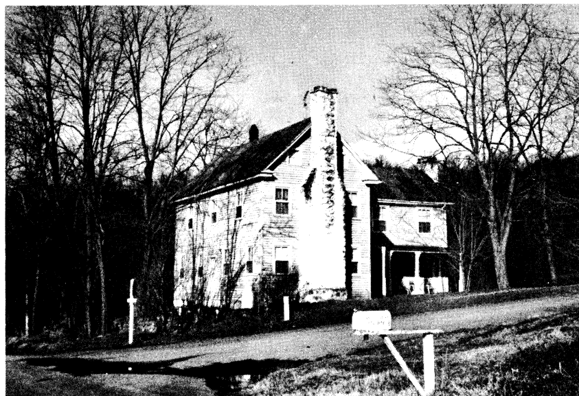
Figure 3. Garland's Store (712 & 631).