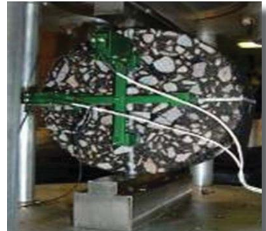
Indirect tensile dynamic modulus test set up

It is anticipated that results from this study will provide guidelines for the implementation of mechanical tests for QC/QA of asphalt mixture in lieu of the current physical and volumetric properties.