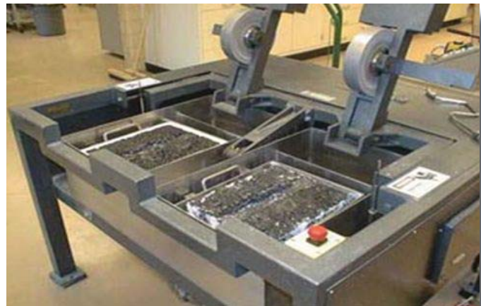
Loaded wheel tracking test set up