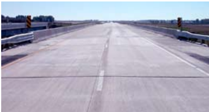
Figure 12 - Iowa 60 award-winning precast, post-tensioned approach slab in O’Brien County

A new integral abutment bridge on Iowa 60 in O’Brien County near Sheldon was chosen as a test bridge for the installation of precast, post-tensioned concrete approaches—the first known application in the United States. The structure is a three-span, continuous prestressed, concrete-girder bridge, 303- by 40-feet, with a right-ahead, 30° skew angle (Figure 12).