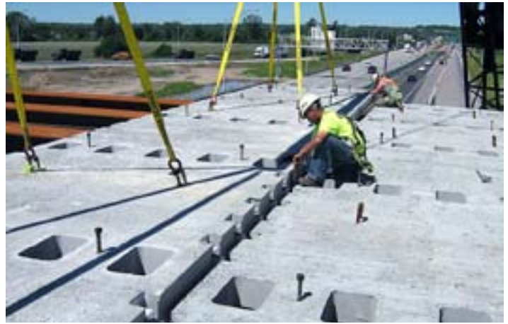
Figure 9 - Deck panel placement at 24 th Street project site

The project was let using A+B bidding, a method of rewarding a contractor for completing a project as quickly as possible. By providing a cost for each working day, the contract combines the cost to perform the work ("A" component) with the cost of the impact to the public ("B" component) to provide the lowest cost to the public. The winning bid on the project bid was 175 calendar days, 35 days less than the maximum allowable bid of 210 calendar days. Intelligent transportation systems were used to manage traffic delays during construction and ease post-construction congestion. Using ABC techniques allowed this bridge to be constructed in a single construction season (typically a two season project) while staging minimized traffic disruptions.