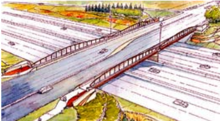
Figure 7 - Rendering of completed 24 th Street project (HDR Inc.)

The new bridge at 24 th Street (Figure 7) is a two-span, 353-foot continuous steel girder bridge with composite precast deck panels (Figure 8). The bridge has an overall width of 105-feet, 8-inches, including sidewalks and a shared use lane. The bridge deck is comprised of 52-foot 4-inches wide by 10-foot long by 8-inches thick precast concrete deck panels joined together with a 1-foot wide cast-in-place longitudinal joint. The deck panels are pretensioned transversely and post-tensioned longitudinally after placement. The deck panels (Figure 9) were compositely bonded to the girders by shear studs and grouted stud pockets.