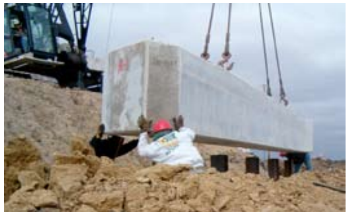
Figure 6 - Placement of precast abutment footing was accomplished in less than 15 minutes at the Boone County site.

The Boone County bridge is an IBRC program project and incorporates precast abutments, pier caps, beams, and full-depth deck panels. This is the first time the Iowa DOT has used the precast abutment and pier cap. It is the second time this type of deck panel has been used in the United States. Iowa DOT officials used this replacement bridge to determine the feasibility of using precast concrete bridge components to accelerate construction for future projects in the state.