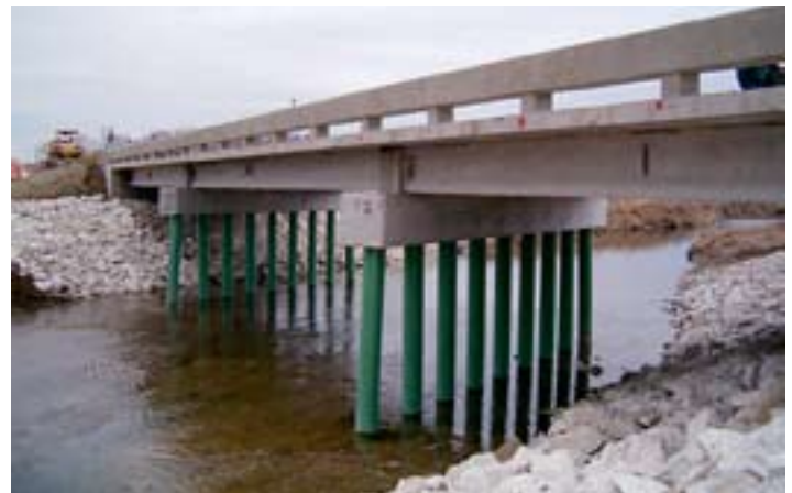
Figure 4 - Completed Boone PPC beam bridge

At the Boone County project site, the existing Marsh Rainbow Arch Bridge (the Mackey Bridge) over Squaw Creek was replaced by a pretensioned, prestressed concrete (PPC) beam bridge (Figure 4). The replacement structure is a continuous, 151- by 33-foot, three-span bridge with a four-girder cross section. The prestressed concrete girders support a full-depth, precast concrete deck.