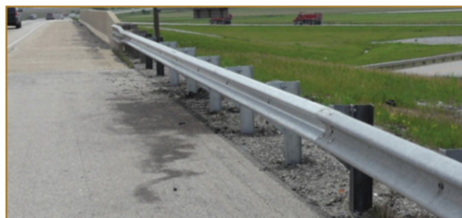
Figure 1. Crash site on I-65 adjacent to mile marker 193.4 with approximately $1,600 in direct repair costs. Top: before repair. Bottom: after repair.