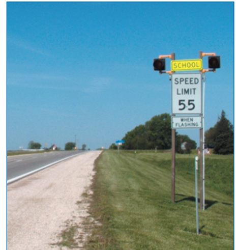
Figure 1. Original static school speed limit sign with flashing beacons

The dynamic, electronic signs were effective for the westbound direction of traffic for all time periods and for both start and dismissal times. Even though only modest changes in mean and 85th percentile speeds occurred, with the speed decreases, the number of vehicles exceeding the school speed limit decreased significantly, indicating the signs had a significant impact on high-end speeders.