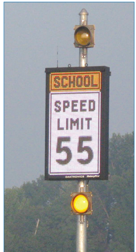
Figure 2. Dynamic, electronic school zone speed limit sign at United Community Schools on US 30 between Ames and Boone, Iowa