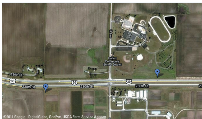
Figure 4. Satellite map of United Community Schools on US 30 between Ames and Boone, Iowa