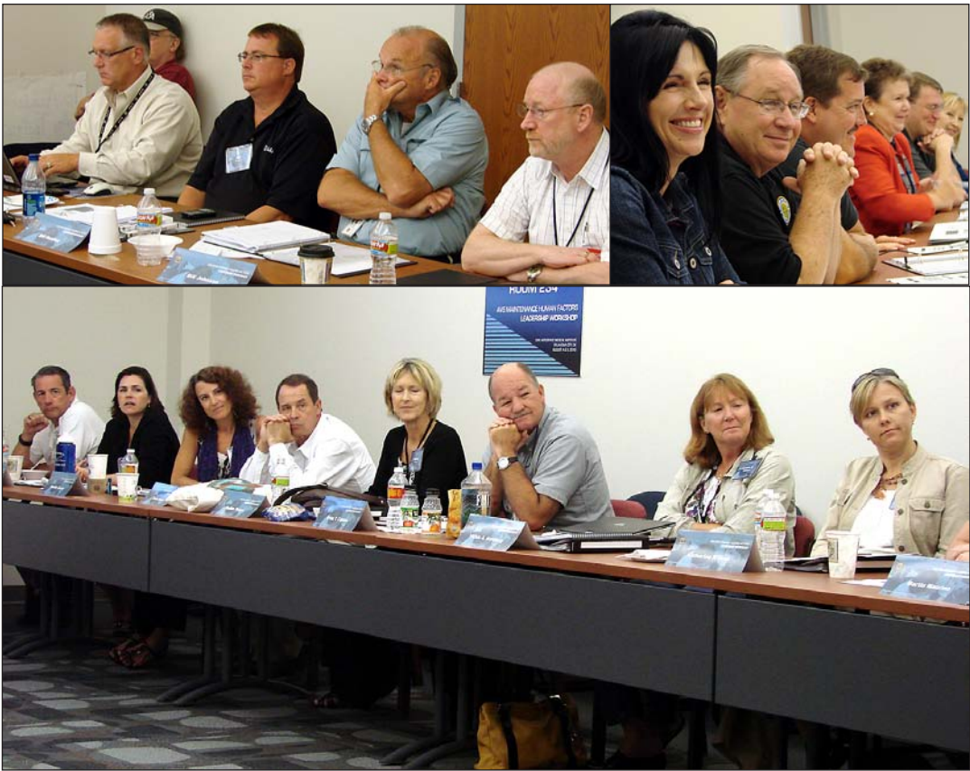
Figure 1. The AVS MX HF leaders in action