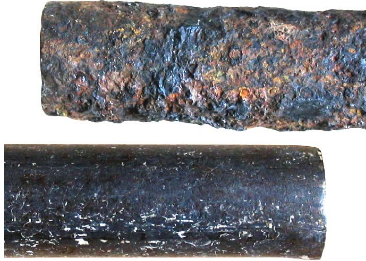
Figure 2. Plain steel dowels: corroded (top) and not corroded (bottom).