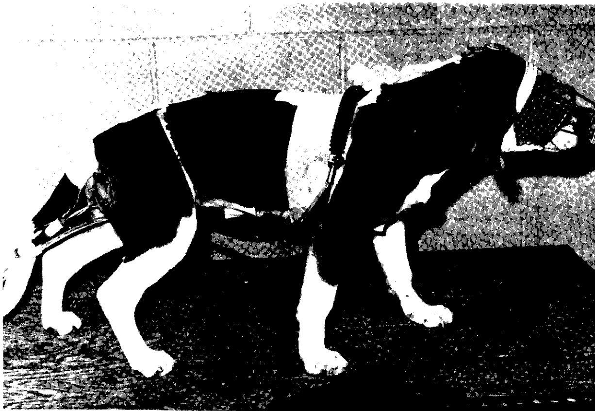
Figure 2. Shows dog prepared for monitoring rectal temperature, heart rate, and respiration rate. Dogs were able to move about freely inside test crate during exposure to cold air temperature.

In the room outside the environmental test chamber, baseline data were obtained on the dogs for rectal temperature (Tre), heart rate (HR), respiration rate (RR), and behavior (barking and excessive movement) for 45 minutes. At the same time, air temperature and humidity were monitored for the test crate inside the cold chamber to determine the crate's micro-environment with dog absent. Starting at 10:00 a.m. regularly, dogs were hand-carried into the environmental chamber and placed in the pre-chilled test crate. During cold exposure the dogs continued to be monitored for the Tre, HR, and RR using noninvasive methods (Figure 2). 5 Both barking and excessive movement were