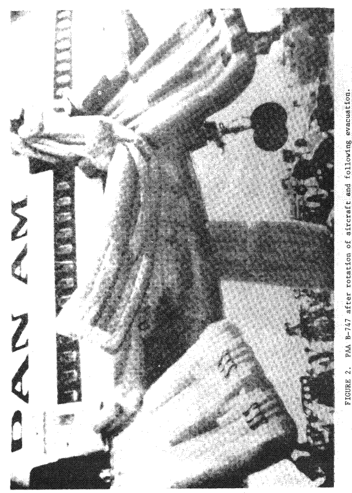
PAA B-747 after rotation of aircraft and following evacuation. Slides at the right and left front doors, number 2 exit slide, and slide at lounge area exit are shown.