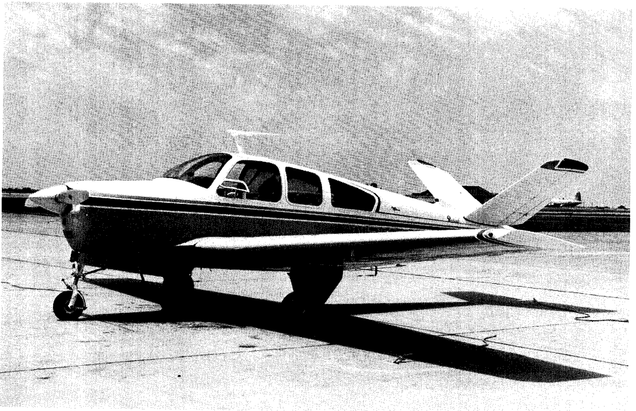
FIGURE 2. Beechcraft Bonanza 35A used in peripheral vision flight display study.

The heading indicator (F, Figure 1), placed immediately below the localizer instrument, consisted of a horizontal case with a lubber line in the center and a moving, servoed tape imprinted with heading numerals. An adjustable moving black pointer indicated deviation away from a desired heading preset at the lubber line and also showed which way the pilot should turn to correct his heading.