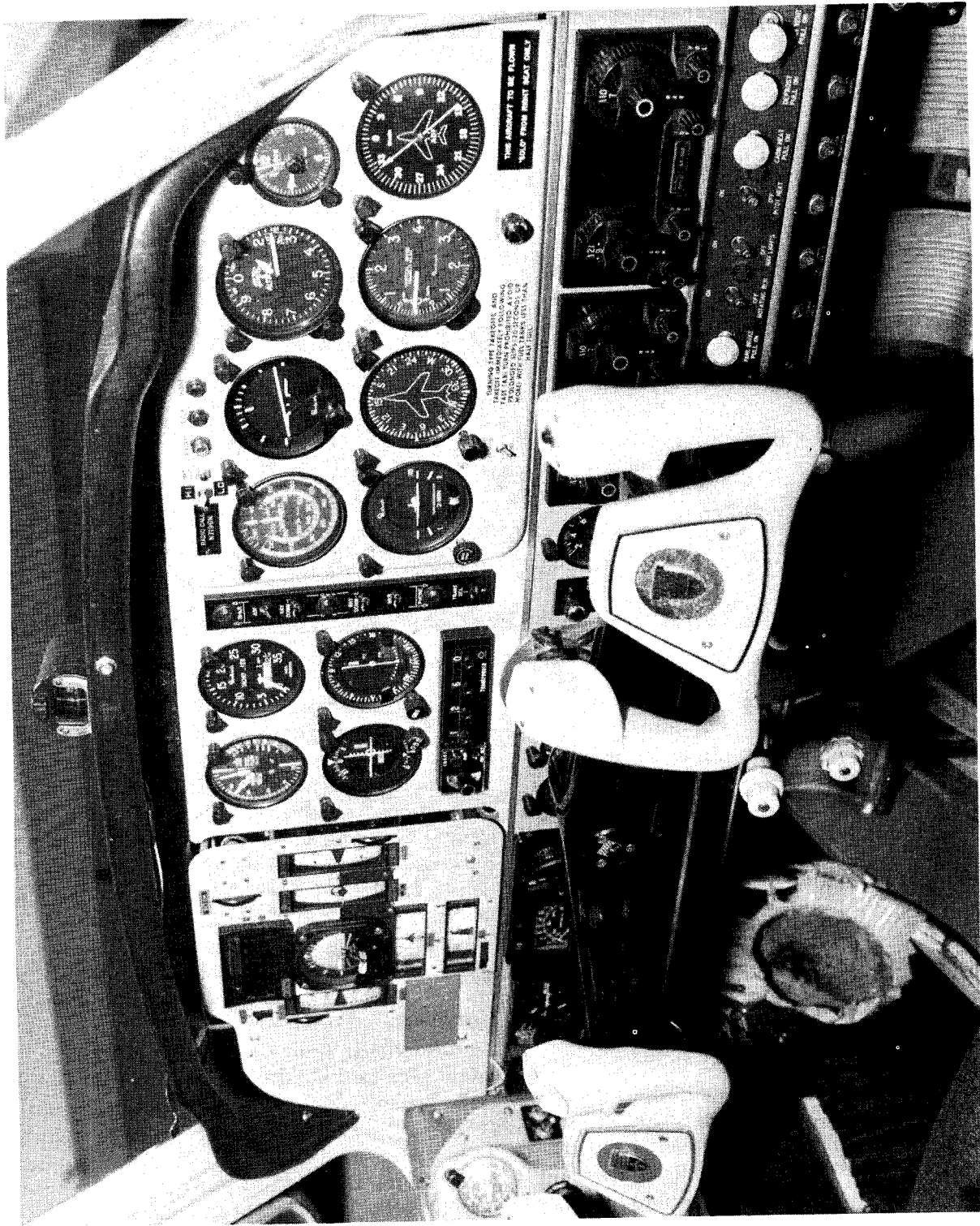
FIGURE 3. Comparison of areas occupied by peripheral vision flight display (left) and conventional panel (right).