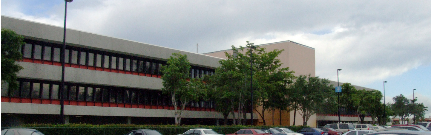
The Lehman Center is housed at the College of Engineering and Computing, Florida International University.

The Lehman Center for Transportation Research (LCTR) at Florida International University (FIU) in Miami is a major computer technology resource for Florida's transportation planners. Researchers at the center specialize in developing advanced computer applications, with a strong emphasis on data management and transportation system modeling.