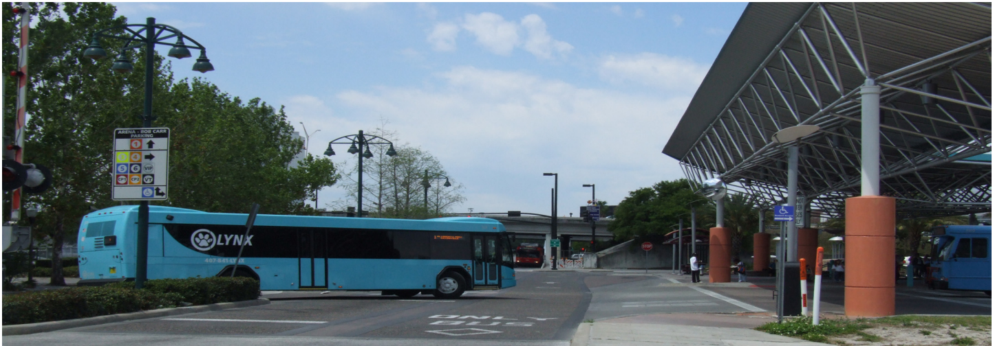
The central station for the Orlando, Florida LYNX bus system.

In 2005, Florida's population was 17.9 million people. By 2010, that figure is expected to grow to almost 20 million.* Just over 50 percent of Florida's residents live in towns, cities, and suburbs. That percentage will rise as the population increases and more open land is developed. Florida's growth is significantly impacting the state's traffic levels.