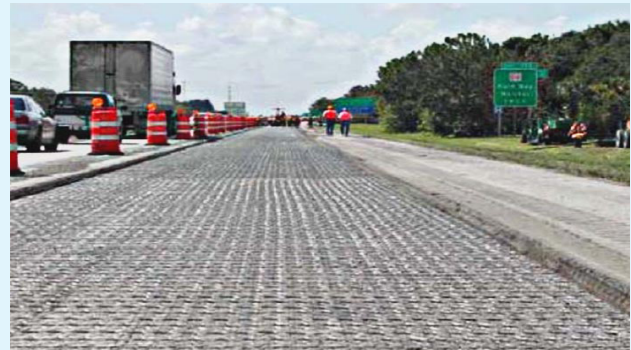
Reinforcing grid between subsoil and asphalt.

While the organic soil will still settle, researchers expect that the geosynthetic materials or the steel-mesh will create an intermediate reinforcing layer over the soil that will help support the pavement. FDOT's State Materials Laboratory will monitor the test strips over time to see how effectively they perform in extending the service life of the road. While this treatment is not expected to provide as long-lasting a benefit as the lightweight fill solution, it is more cost-effective and should significantly reduce the need for resurfacing.