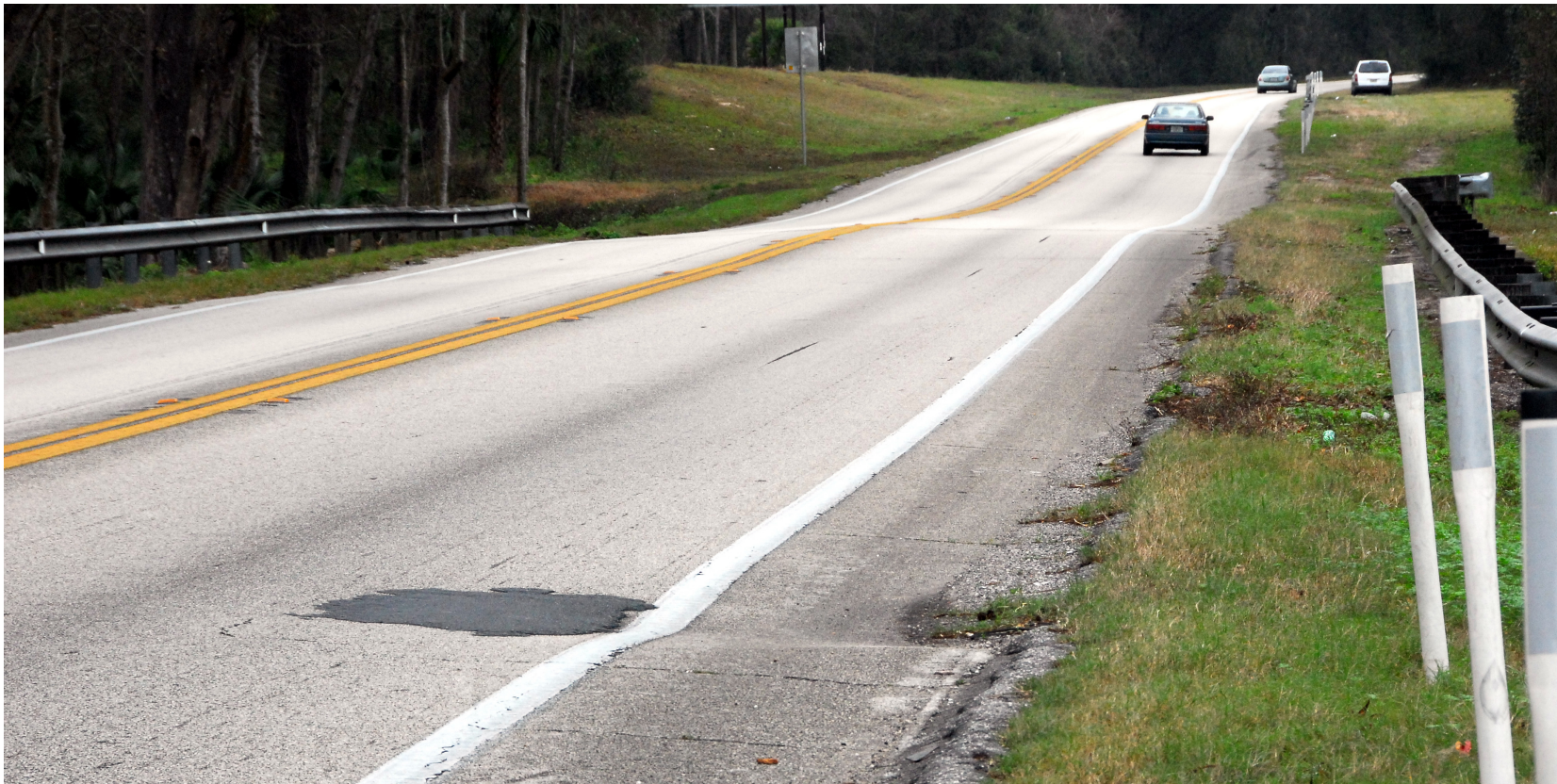
State Road 40 east of Ocala, Fla. travels through a swampy wetland near the Silver River. The depression in the pavement visible at the far end of the bridge zone, the patched pavement damage in the foreground, and sunken side curb all are results of settling organic soil.

bridge would have been cost prohibitive due to the depth of the existing asphalt, but surcharging showed promise for new construction and less severe maintenance applications.