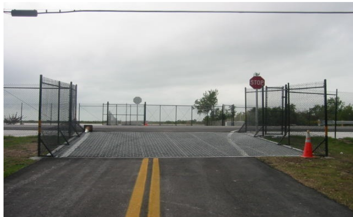
Deer guard on side road entering US 1 on Big Pine Key.

Researchers placed cameras in the tunnels to monitor how often the deer use the underpasses. Usage rose