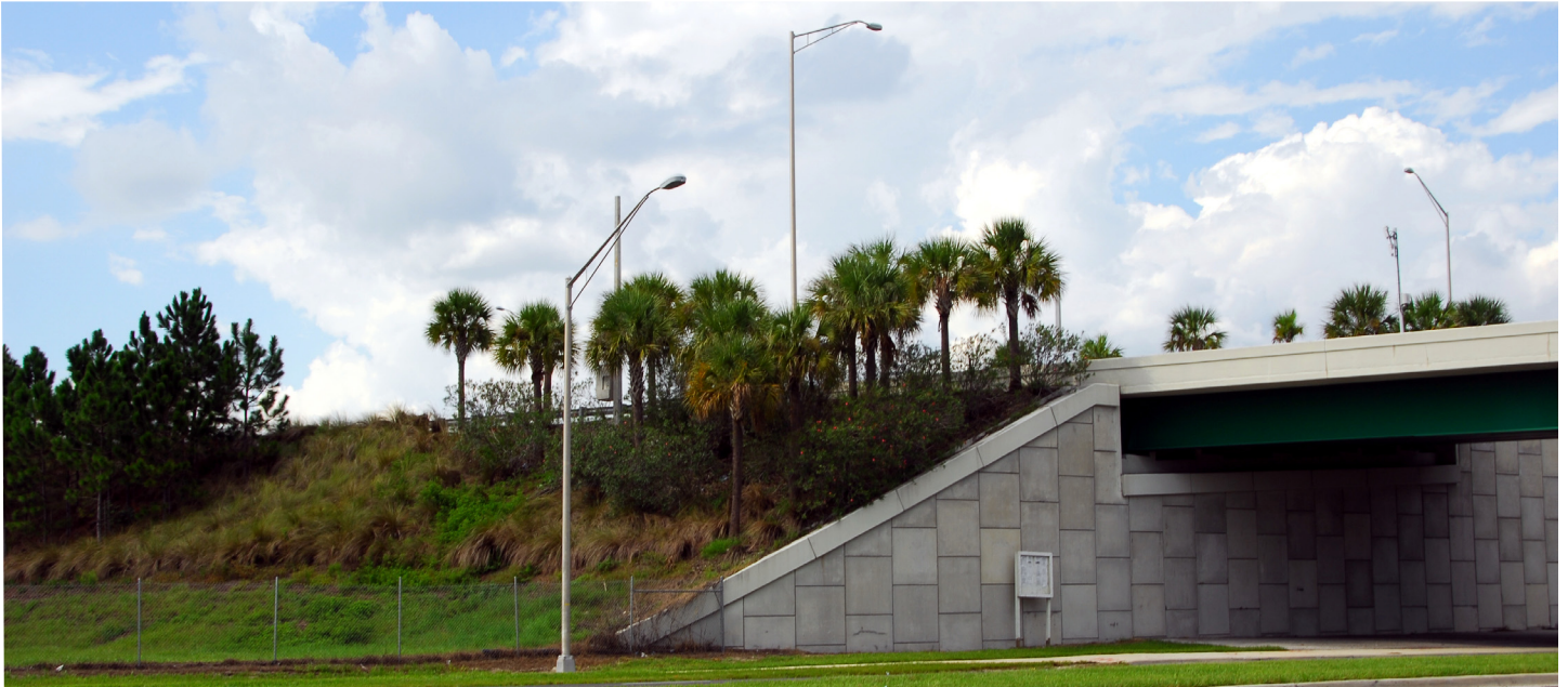
The surcharged embankment at Lake Mary Boulevard, which the study predicts will compress by only two inches in the next 20 years.

The research team arranged to monitor the SR 417 overpass embankment at Lake Mary Boulevard to determine how much settlement would occur during the surcharge period. They installed sensors at several levels and in several locations in the embankment soil, which was overbuilt by 20 feet. The sensors were hardwired to a data logger.