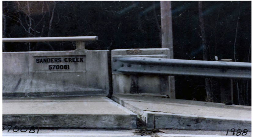
The Sander's Creek bridge 20 years ago clearly shows the ramp sloping due to soil compression.

Maintaining pavement levels for ramps built over organic soils can become an ongoing challenge, as has been the case at the bridge at Sander's Creek (also known as Swift Creek) in the Florida Panhandle. The bridge, which is on State Road (SR) 20 near Eglin Air Force Base, was built in 1974. The approach embankments at the bridge were built using local soil with more than 50 percent organic content. High organic content in soils makes them vulnerable to ongoing compression or settlement, a phenomenon known as "creep." Creep caused the ramp at Sander's Creek to drop, the ramp pavement to crack, and the curb along the embankment edge to nearly disappear.