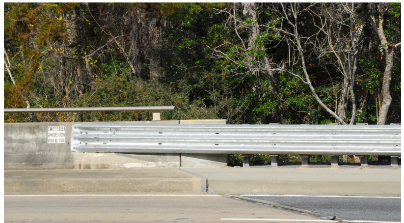
Repaving has made the ramp of the Sander's Creek bridge today nearly level with the bridge.

All soils settle to some degree, but the high organic content of Florida soils makes them softer than most. As the soils would sink, more asphalt would be added to repair the damage caused by the settlement. This solution initially raises the level of the ramp but adds weight to the soil, which continues to settle. The fix is short-term and can result in embankment distress requiring expensive repairs.