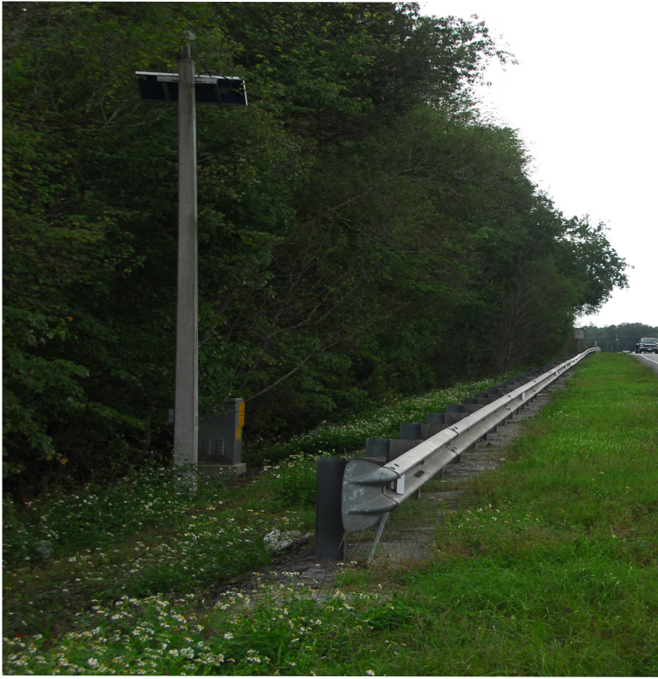
(Above and right) Inductive loop detectors on U.S. 301 between Waldo and Starke, Florida.