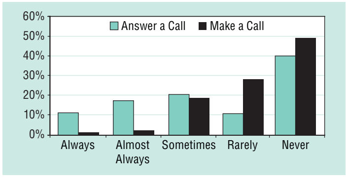
Figure 1. Frequency of Answering and Making Calls While Driving

Of these same respondents, 2% are always, 3% are almost always, and 18% are sometimes willing to make calls. Forty-nine percent of drivers report never making calls while driving. Of those respondents who indicated that they make calls while driving, most use speed dial or their "favorites" to dial the phone numbers (53%) as opposed to dialing the 7- or 10-digit phone number.