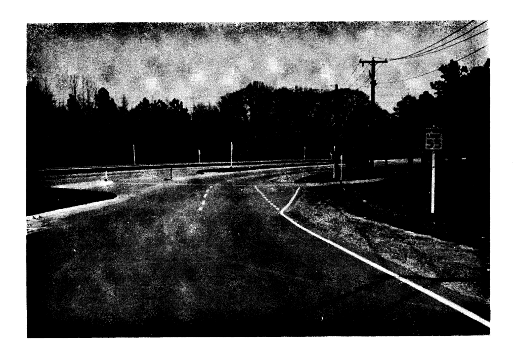
Figure 3. Intersection of Route 147 and Dolefield Road. Pavement marking for "after" conditions.

The pavement marking extension was a broken line consisting of 5-foot painted dashes separated by 8-foot unpainted skips. The marking was applied along the entire length (200 ft.) of the deceleration lane taper.