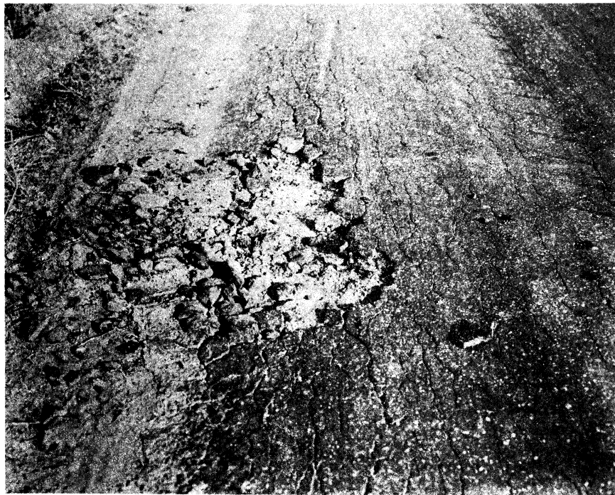
Figure 3. Disintegration of pavement edge.