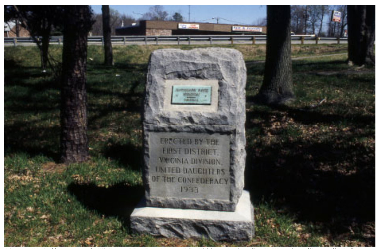
Figure 11. Jefferson Davis Highway Marker, Erected in 1933 at Falling Creek Wayside, Chesterfield County

Management Issues and Recommended Guidelines. It is important to determine ownership of historical markers or monuments of this kind, particularly if they might be impacted by projects or if they pose a safety hazard and must be relocated. For many monuments, particularly for those dating after the establishment of the state primary and secondary highway systems, the sponsoring groups erected markers with the agreement that the monuments would then pass into state ownership upon dedication. (The UDC monuments along