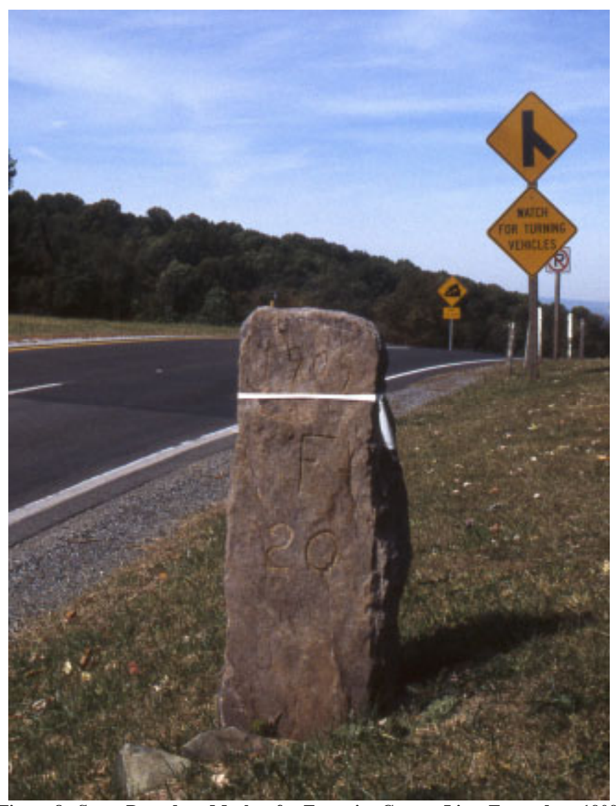
Figure 8. Stone Boundary Marker for Fauquier County Line, Erected ca. 1909

Representative Examples. An excellent example of an older county line marker can be seen on the northeast side of Route 50/17 near the intersection with Route 601, approximately 1 mile west of the village of Paris in Fauquier County. This is an irregular stone; its above-ground dimensions are 38 inches high, 13 to 19 inches wide, and approximately 8 inches deep. Carved on the stone is the inscription "1909 / F / 20" (Figure 8). Sometimes mistaken for a road stone,