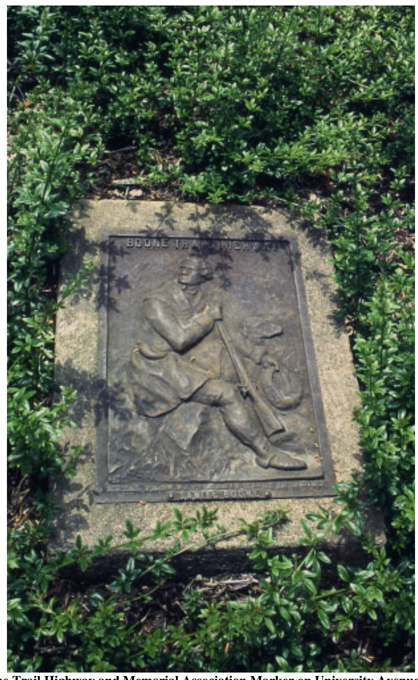
Figure 10. Boone Trail Highway and Memorial Association Marker on University Avenue on the Grounds of the University of Virginia, Charlottesville

Revolution in 1930 at the intersection of what is now Route 20 and Route 639 in Orange County. The surrounding land is the Montpelier estate, formerly Madison's home. In 1984, the estate became a museum property of the National Trust for Historic Preservation; however, in 1930, Montpelier was still a private estate, and such a monument was seen as a way of honoring an historical figure whose home was not open to the public. The monument is a rough-hewn granite stone; its above-ground dimensions are 59 inches high, approximately 45 inches wide, and approximately 16 inches deep. On it is mounted a bronze memorial plaque 24 inches wide