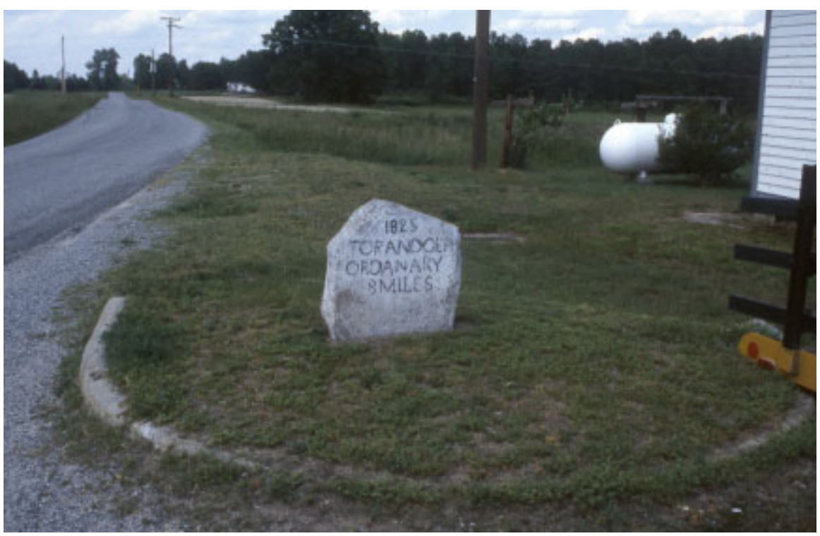
Figure 3. Road Stone at Valentines, Brunswick County, Dated 1825

Surviving milestones include examples from a number of early turnpikes. Five milestones, erected in the 1830s, survive from the Northwest Turnpike (the predecessor of part of