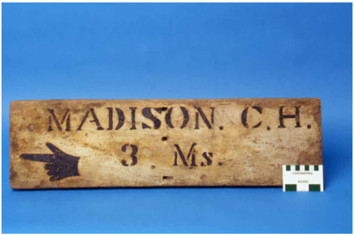
Figure 2. 19th Century Signboard from Madison County

Management Issues and Recommended Guidelines. It is unlikely that any intact early signboards will be discovered in place. However, any that is found should be brought to the attention of the VDOT district cultural resource personnel, who can document and advise on protecting and preserving the resource.