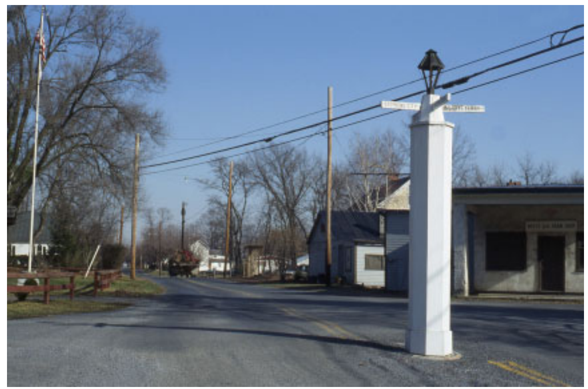
Figure 1. "White Post" at White Post, Clarke County (a 20th century recreation of the 18th century original)

Fairfax's landholdings (the Northern Neck Proprietary). It has been replaced a number of times since, with the design of each post apparently based on its predecessor. The latest post was erected after a 1998 vehicle impact destroyed the previous post. The octagonal post stands approximately 12 feet tall and has four signboards, pointing the ways to Berry's Ferry, Stephens City, Battletown, and Greenway Court (Lord Fairfax's local residence).