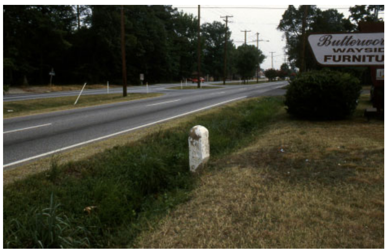
Figure 6. Milestone 7 on Manchester-Petersburg Turnpike, Chesterfield County, Erected in 1820s; Showing Location in Right of Way

Management Issues and Recommended Guidelines. Early road stones and milestones remaining in their original locations are considered eligible for the National Register. Given the relatively small numbers of surviving stones of this type, any that is found should be brought to the attention of the VDOT district cultural resource personnel, who can check to see whether the resource has been previously documented, and if not, can document and advise on protecting and preserving the resource.