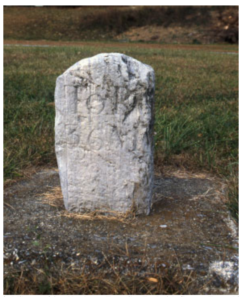
Figure 4. Milestone 36 on Northwest Turnpike, Frederick County, Erected in 1830s

The Northwest Turnpike milestones, all of similar design, are rectangular limestone stones. The ranges of the above-ground dimensions are approximately 16 to 18 inches high, approximately 10 to 15 inches wide, and approximately 6 to 8 inches deep. Milestones 38, 36, 35, 33, and 31 survive, indicating the distances to Romney (now in West Virginia). Carved on each stone is the inscription "TO R" and the mileage, i.e., for the first stone "38 M," with subsequent stones marked "36 M," "35 M," etc. The inscription indicates "To Romney 38 [or 36, etc.] miles." Each of these milestones was reset in a concrete base during the improvements to Route 50 in the mid-20th century (Figure 4). Where construction of a new alignment or other changes prevented the old milestone from remaining in its original location, it was reset as close as possible to the original location and in the same relationship as it originally had to the highway right of way.