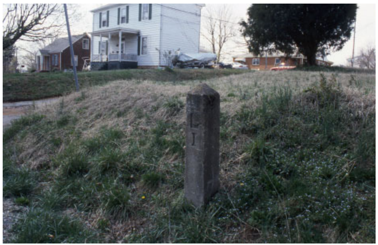
Figure 7. "L1" (1 Mile to Lynchburg) Concrete Mile Marker, Erected ca. 1910 by Amherst County, in Madison Heights

The concrete of such resources may be fragile because of its composition, insufficient rebar, the action of weather, the application of substances that are reactive with the concrete, and/or previous damage. Since early concrete structures of this type can be damaged, broken, or eroded by mechanical impacts, maintenance operations should be done with care around any resource of this type to avoid damage to the object. Avoiding impacts to such sites can often be successfully done in maintenance work since many maintenance projects are not ground-disturbing but instead involve work such as ditch clearing, mowing, etc. In an area with known resources of this sort, impacts can usually be avoided by using a light touch with lawnmowers, weed whackers, larger mowers, etc. Any materials applied near such a resource should not react with concrete. The placement of flagging tape or erosion fence around a vulnerable site or resource creates an easily erected and easily noticeable boundary for crews or contractors.