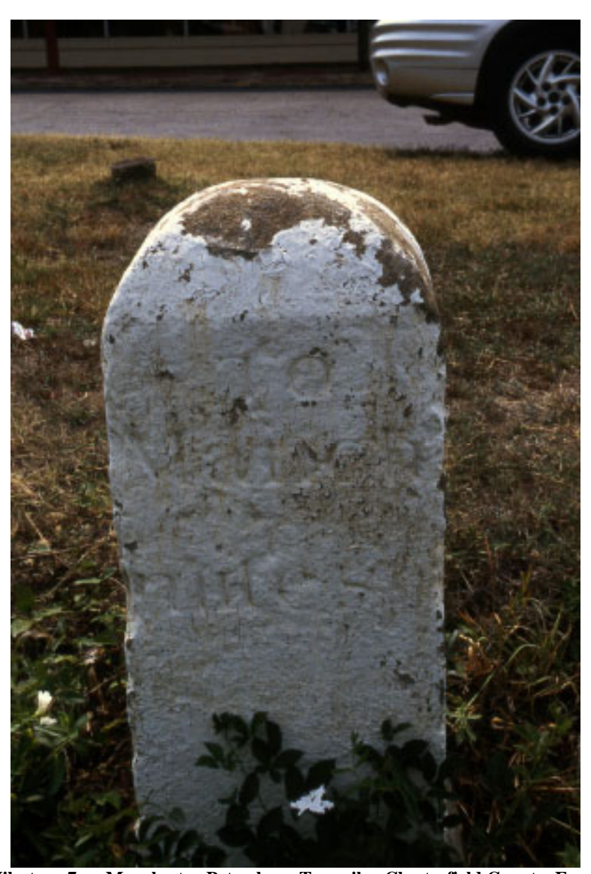
Figure 5. Milestone 7 on Manchester-Petersburg Turnpike, Chesterfield County, Erected in 1820s

The Manchester-Petersburg Turnpike milestones, also all of similar design, are rectangular stones with rounded tops. Whitewash or white paint thickly applied to these stones prevents precise identification of the type of stone used, but all are likely of local granite. The ranges of the above-ground dimensions are approximately 32 to 33 inches high (although one is 26 inches high), approximately 15 to 16 inches wide, and approximately 8 to 11 inches deep. Milestones 1, 6, 7, and 9 survive, indicating the distances to Manchester. Carved on each stone is the inscription "TO MANCH" and the mileage, i.e., for the first stone "1 MILE," with subsequent stones marked "6 MILES," "7 MILES," and "8 MILES" (Figures 5 and 6).