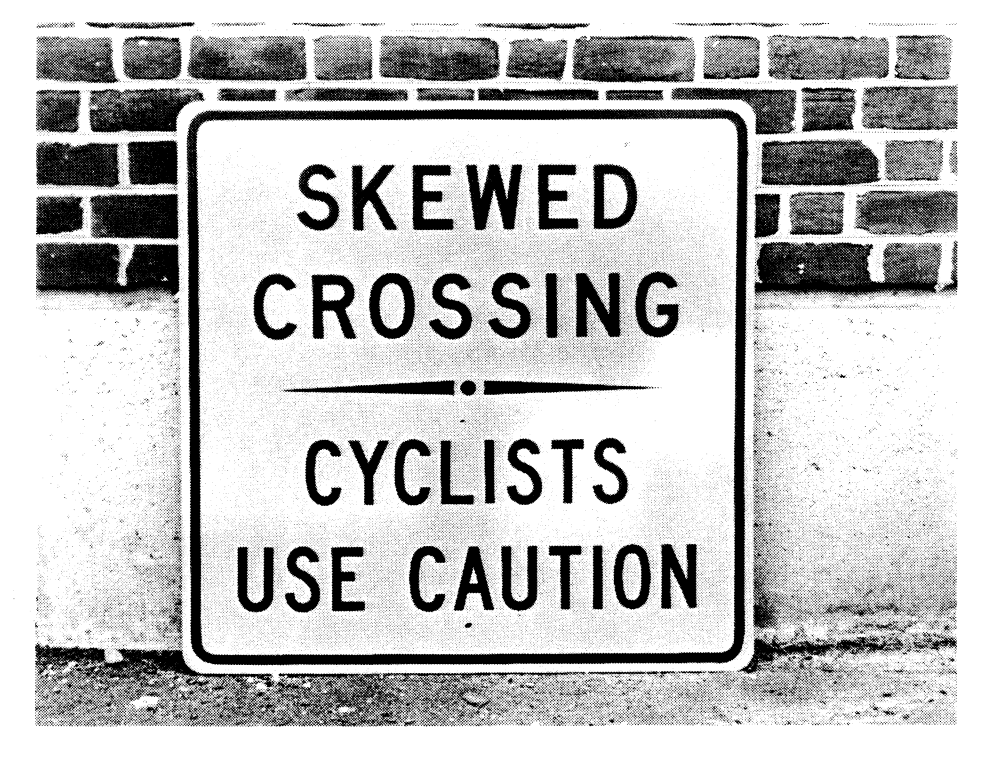
Figure 2. Word message skewed crossing sign.