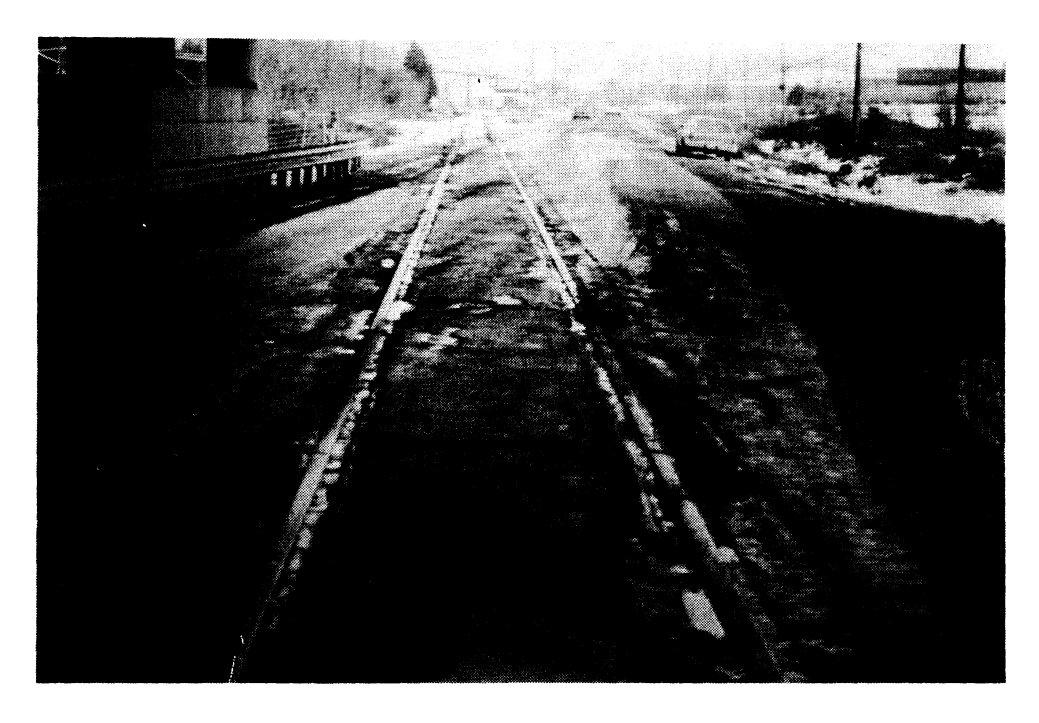
Figure 4. Study site on Rte. 974 in Harrisonburg.