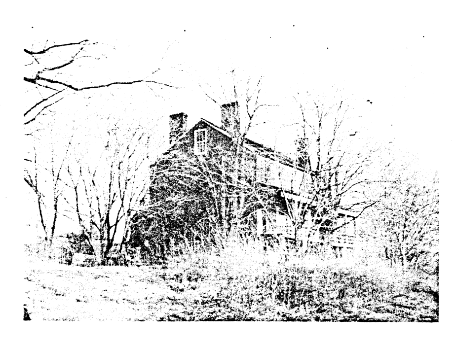
Figure 2. Crossroads Tavern (692 & U.S. 29).

The road today passes many buildings that were there during the original use of the road. Among the extant buildings that served the original road are toll houses and taverns. Three are shown in Figures 2-4. One tavern is located at Cross Roads (on the western side of Route 29); a toll house is at Garland's Store, located at the intersection of Route 712 and Route 631; and another tavern is in Scottsville. A detailed history of the architecture along the road is being compiled by Dr. K. E. Lay, a professor of architecture at the University of Virginia.