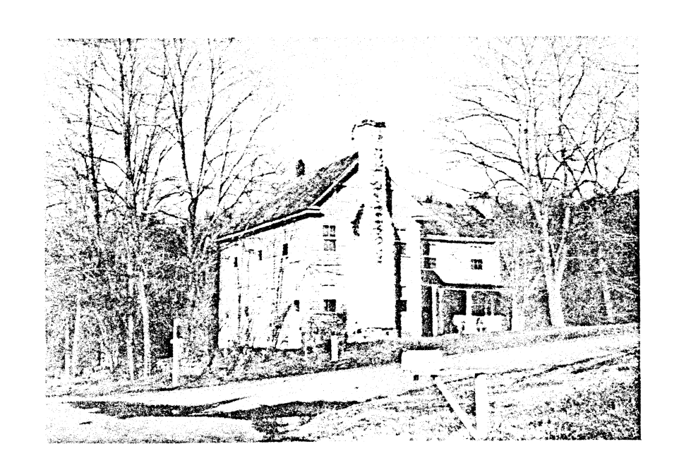
Figure 3. Garland's Store (712 & 631).