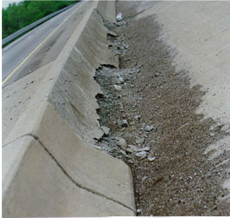
Figures 10A and 10B: Typical deterioration caused by freeze thaw attack.