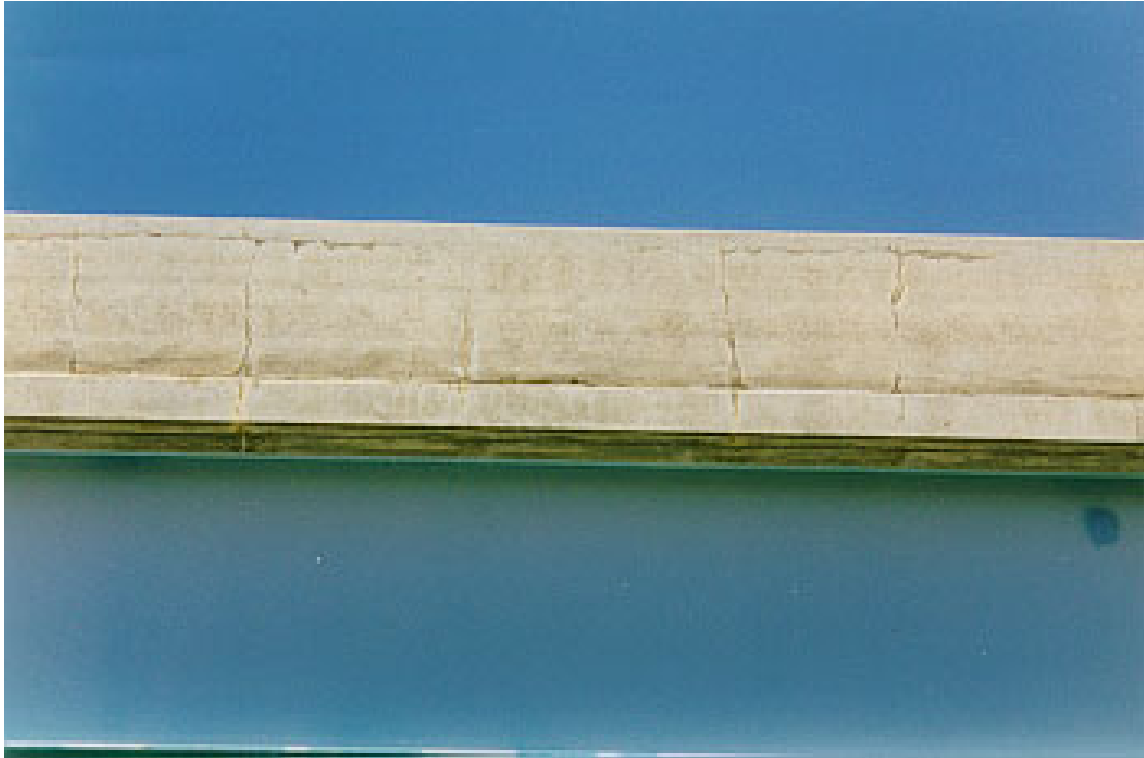
Figure 20: Typical horizontal crack deterioration noted within three years after barrier construction (WB I-496 over the Red Cedar River in Lansing). These tensile stress cracks in slipform barriers are a result of early-age stresses developed from slumping plastic concrete.

A concern that contributes to poor performance of slipform barriers is the lack of the ability to conduct thorough quality control construction inspections to assure minimum protective concrete cover over reinforcing steel prior to slipform concrete placement. Figures 21A and 21B show typical deterioration due to insufficient concrete cover over black reinforcing steel. Further aggressive concrete deterioration and corrosion of black reinforcing steel as a result of inadequate protective concrete cover at the toe of the barrier may be further aggravated by impact and abrasion brought on by highway snow removal equipment.