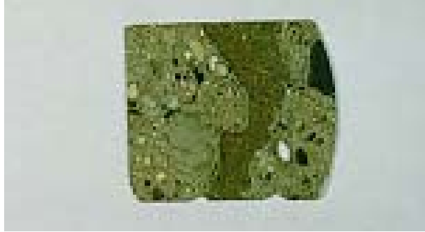
Figure 15: Lens of sand detected in concrete core specimen sampled from slipform barrier. The lens was observed to be located within approximately 6 mm from the traffic-bearing surface.