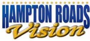
Table of Contents (continued)