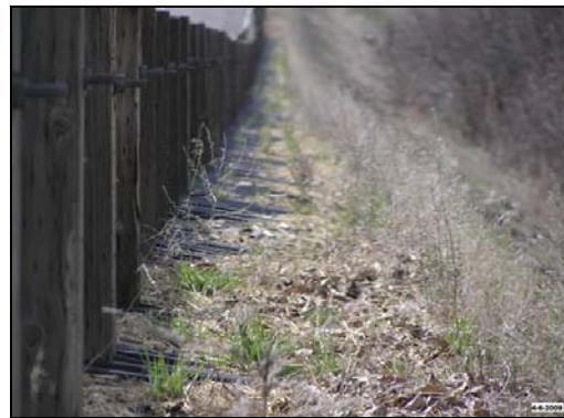
SR 826, fall 2009- Cracked and damaged matting with vegetation growing up through the mats.