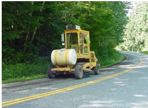
Adjustments to maintenance practices such as sweeping and winter snow plowing help remove edge build up without adding cost. (isn't there a cost associated with sweeping?)

The historic practice of maintaining a vegetation-free strip with herbicide was proven to be significantly less expensive than any of the alternatives tested. Due to the fact that mowing operations move at a much slower rate than spraying operations, it costs about half as much to spray rather than mow the edge. A vegetation-free strip also helps to alleviate edge build-up and surface drainage problems and reduces the life-cycle cost. However, there are many situations throughout Western Washington where shoulders are mowed regardless of the presence or absence of a vegetation-free edge. There are also cases where for various reasons edge build up is not a factor. In these cases, where annual mowing is done regardless and grass at the edge of pavement is not a factor or does not cause problems with surface drainage, maintenance of a vegetation free zone has no advantage and becomes an unnecessary extra cost.