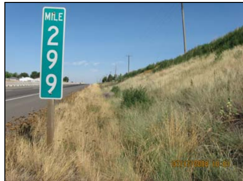
US-12 Phase I, MP. 299, Summer 2008