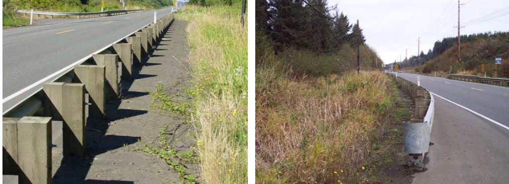
New pavement and guardrail was installed in 2003. Photo on the left shows condition in 2005 after two years, photo on the right is from 2007 showing debris accumulation after four years. Rails along this section of SR 105 were cleaned in 2008.

significant maintenance expense. The rate of buildup and need for removal varies with location depending on traffic and maintenance operations, but in this case cleaning appears to be necessary on a 5 to 7 year cycle. The pavement surface under the rail in this case is flat which tends to build up debris faster than if the surface slopes away from the lanes.