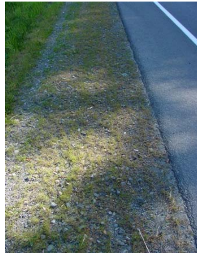
This location has fairly sparse grass growth but no weeds. To date this site has required no maintenance whatsoever.