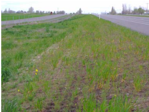
US-12 Phase II, MP. 296 Spring 2006

The two primary goals of this test plot are: 1) Evaluate the cost of maintaining the pavement edge zone (Zone 1) with desirable vegetation compared with traditional bare-ground condition; and 2) Evaluate the ability for desirable vegetation to establish at the edge of pavement.