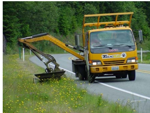
Use of a truck mounted boom mower allows the crew to mow the edge at an average speed of 7 miles/hour and drive to mowing sites at highway speed. The mower is also used to selectively trim vegetation on the back slopes.

Recommendation: This case study serves as an example for an approach allowing vegetation growth up to the edge of pavement that could be applied in other areas throughout Western Washington. The truck mounted mower has