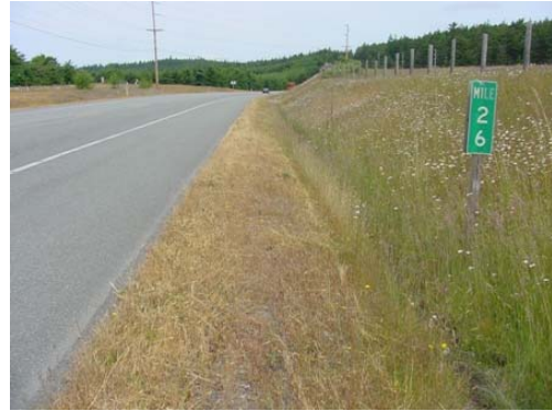
No detectable difference resulted from the treatments, either in the scientific soil analysis or visually in vegetative top growth.

Recommendation: Although compost tea is beneficial in some horticultural applications, it is not practical or beneficial for establishing or enhancing grass stands on the shoulder.