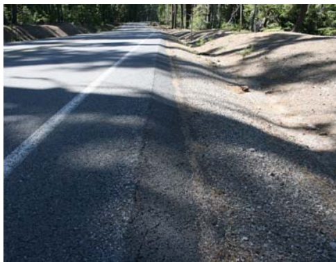
On SR 62 in Oregon (Crater Lake Highway) a safety edge is used in combination with an adjacent shoulder free of vegetation.

Description: The edge of asphalt pavement is finished with a 30 degree angle for the full depth of the paving layer. The term “safety edge” is used for this treatment because it allows vehicles to traverse off and back on the pavement at high speed without getting a wheel caught on a sharp edge drop. However, this treatment also allows for around 6 to 8 inches of sloping surface area for drainage before the non-paved and/or vegetated shoulder begins.