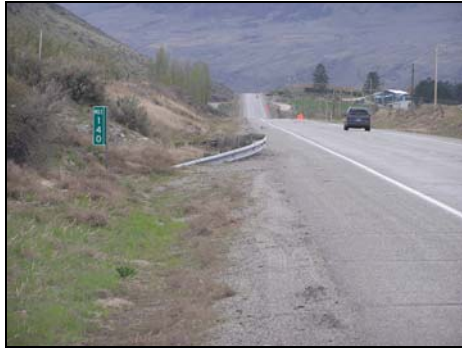
SR 17 Northbound, annual maintenance with bare-ground chemicals.

was never the case; the single band application that was historically used was simply widened to include the old bare-ground. There may have been some minor spot treatments done within this old bare-ground zone but this was very small and very difficult to capture in terms of cost.