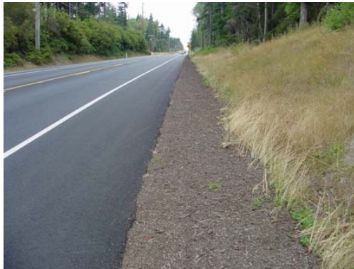
A compost layer is less expensive than top course crushed rock and aids in stormwater management. Course grade material compacts for a drivable surface.

Results: Healthy, mostly weed-free grass stand after several initial years controlling broadleaf noxious weeds such as Tansy ragwort and Knapweed, emerged more frequently in compost as compared to untreated adjacent gravel shoulders. Minimal to no edge buildup in 5 years following construction, buildup has been offset from gradual compost settling, decomposition and compaction. Native grass seed mix was about twice the price per pound as the type typically specified in WSDOT roadside mixtures but performed well.