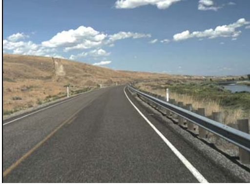
Bareground treatment on SR225, 2008.

Results: This application was very effective at controlling vegetation throughout this area. It held up very well with no significant breakthrough. Costs are substantially higher than standard bare-ground applications due to the amount of travel time between rail sections. For guardrail treatments in eastern Washington the average miles treated for a 4-6' band with was 14 miles. This low production quickly pushes up the cost per mile for this treatment.