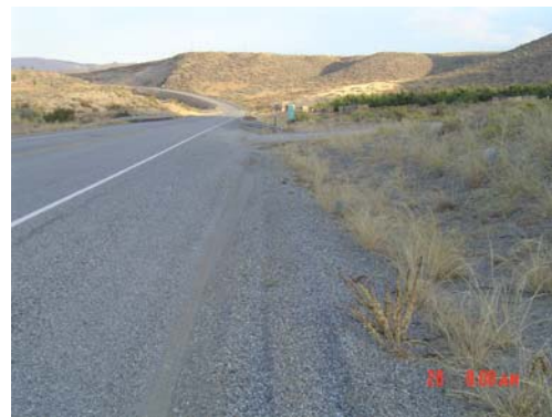
SR 17 Northbound, MP 143, summer 2009, annually maintained with bareground chemical