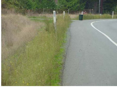
In the first years after residual herbicide use was discontinued, a number of weed species established and spread along the pavement edge. Shown here is a heavy infestation of the annual weed Conyza canadensis or Horseweed.