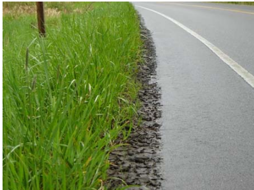
Sediment buildup tends to accumulate along the edge of pavement more rapidly at low spots and insides of curves.