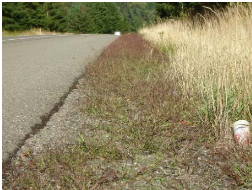
In some locations annual grasses such as crab grass shown here emerged over the summer months. However in a case like this the growth does not impact highway operations or weed management objectives.