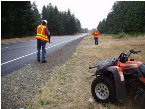
Spreading seed by hand and raking in with an ATV and chain link proved effective and less expensive than hydro-seeding.