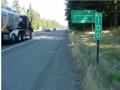
Roughened edge within the study site, shown here four years after installation in 2004.

Recommendation: Work with design to develop a standard for this type of configuration for use wherever possible.