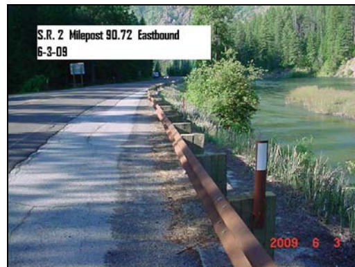
US-2, 2009 five years after installation

Recommendation: While the cost per mile is extremely high, this product may have applications on WSDOT right of way in specific locations, such as highly sensitive areas where chemicals are not an option. Installation costs should be