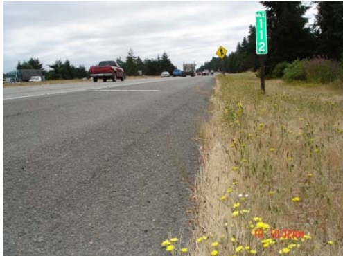
A sloping pavement edge takes the place of a gravel strip in this case and requires no maintenance.

Recommendation: Work with design to develop a standard for this type of configuration for use wherever possible.