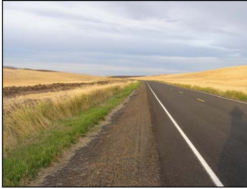
Bareground treatment on SR271, 2008.

Results: This application was very effective throughout the 16 shoulder miles. It held up very well with no measureable failures. In this case the bare-ground application eliminated 2 to 3 mowing passes per year.