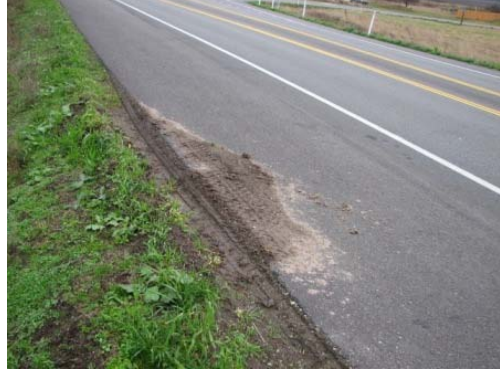
Tires tend to sink into shoulder when vehicles drive off pavement and even got stuck in wet conditions.

Results: Soil was installed too thick (0.7') and not compacted. Too soft, not safe when vehicles drive off edge of pavement, particularly when wet. Initial vegetative growth included a large percentage of nuisance weed species possibly from seeds in the salvaged topsoil.