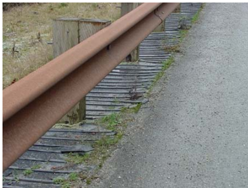
Tiles were damaged by snow and ice thrown by passing plow trucks.

Results: Since the installation of this product in 2006, the manufacturer has made several modifications in design and fabrication to try and alleviate the problems experienced at this and the Eastern Washington test site. However, with the product as designed and manufactured in 2006 there were a number of problems.