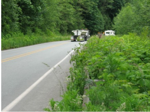
Prior to installation of the fabric, vegetation completely covered the rail every year and had to be manually trimmed.

Results: Although the surface of the soil was cut to the ground just prior to installation, the roots of the plants were well established and some of the more aggressive vegetation began coming up through cracks, around the base of posts, and along the edge between pavement and mat, despite all attempts to seal it off. As in the location on SR 112, this is a heavily forested area and the area applies sand at times during snow and ice events in the winter. These two factors resulted in the mat in this location becoming almost completely overgrown and buried within three years and requiring annual vegetation trimming with string trimmers.