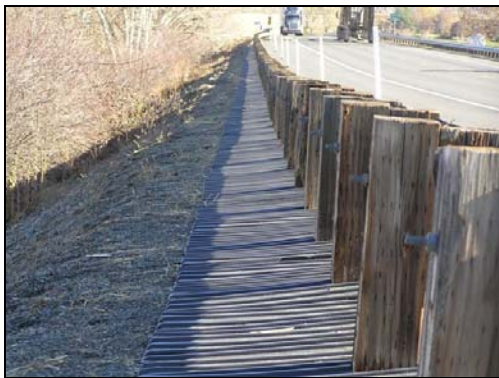
SR 823, Installed in 2006

Results: In general this product was difficult to install and generally did not perform particularly well. It did however provide some weed control through the life of the project, this level of suppression appears to be diminishing annually as the condition of the mats deteriorates. The material didn't hold up well to any type of impact from traffic or an inadvertent plow blade. Further it was more difficult to move or patch these mats when they did become damaged.