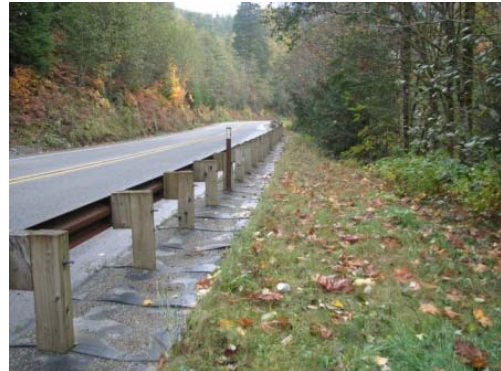
This is the mat after three years. Some sand build-up, but it seems to blow or wash off over the course of each summer, no maintenance has been done at this location.

Recommendation: One potential drawback for this product is the lack of permeability and the possibility that use in projects could trigger the regulatory requirement for additional stormwater management facilities, impacting project design and overall cost. However for the duration tested, the Traffix Weedmat proved to be durable and functional in preventing vegetative growth.