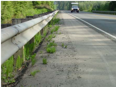
Field horsetail grows in wet areas and if not controlled will come up through several inches of asphalt causing the pavement to deteriorate. The only way to manage horsetail is with selective herbicides.

Recommendation: Continue to maintain mechanically as necessary to prevent guardrail and hardware overgrowth, and to preserve site distance. Remove shoulder build-up when necessary to aid highway drainage.