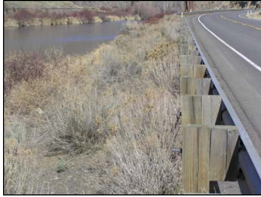
SR 821 MP 21.10, 2004 two years after bare-ground treatments ceased