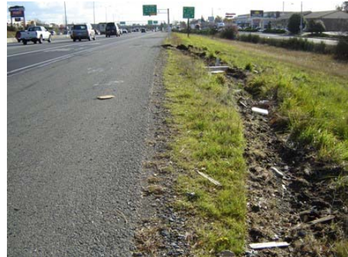
At one point an errant vehicle left and returned to the road right at the location where the monthly documentation photos were taken, illustrating the importance of having a solid and even transition between paved and non-paved shoulder.

Recommendation: The contrasting cost of this case versus the one in Everett shows that this method may not work well in certain locations. It also brings out a point with relation to design and construction in relation to placement of junction boxes and delineation markers. If grass is allowed to grow to the edge of pavement, junction boxes will get buried under debris and subject to damage when any kind of shoulder reshaping is done. Delineators if not placed in a vegetation-free zone create obstacles to shoulder grading and/or mowing operations. Placement of these elements should be determined in conjunction with the overall design and planned maintenance approach for any given situation.