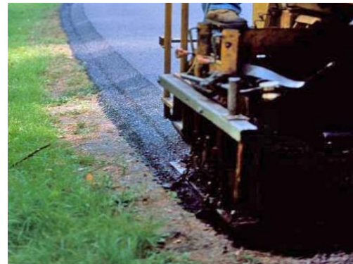
Pavement edge design also can help manage edge build up and allow for stormwater surface drainage where grass is allowed to grow up to the edge of pavement

For guardrail locations, the most effective and least expensive method of any of the alternatives tested was treatment with residual herbicides. This is due mainly to the fact that soil/debris deposition and edge build-up occur faster around guardrail posts when vegetation is present, and removal is more expensive. Also, in almost all locations in Western Washington where vegetation is allowed to grow around the base of guardrail, mowing or trimming is required and is