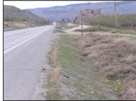
SR 17 Southbound maintained with selective herbicides only. Native grasses have begun to establish along pavement edge.

Cheat grass was one of the first species to migrate into the old bare-ground zone, while this isn't a desirable species it is better than many of the noxious weeds we expected. We believe that the cheat grass was at least helpful in reducing kochia, Russian thistle and other noxious weeds. Sand dropseed ( Sporobolus cryptandrus ) began to appear in 2007 as well, particularly at the edge of pavement. This species has continued to move out and is slowly filling in. Several other species have appeared in smaller quantities including Sandberg bluegrass ( Poa secunda ) as well as several wheatgrass species. It should be noted that while both sides of the roadway provided adequate weed control the Southbound side did look a little more unkempt when compared to the traditional bare-ground option. This appears to only be an aesthetic issue and did not cause any operational issues during the duration of this test.