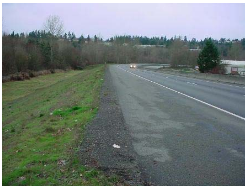
This shows the site in the fall after the paving project was completed in the summer of 2002.