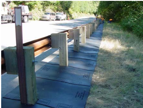
The Traffix Weed Mat were the easiest of the under guardrail products to install. This is the product being installed in 2006.

Results: This product is relatively heavy and at the time of installation was the most expensive of all under-guardrail weed barriers considered. However, possibly because of its weight and composition was the product that held up best over the three year duration of the study. The product is semi-permeable but due to its thickness tends to catch and channel water along the pavement edge. The expense of the material itself and extra cost in shipping is somewhat offset by the ease of installation. One thing learned after installation is that the overlapping edge of the mats at the seam should be with the direction of traffic. In this installation the overlapping edge faces toward traffic and tends to catch winter sand and debris at the seams.