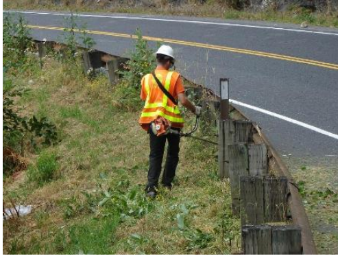
Terrain behind the rail along this stretch of 101 and Lake Crescent is uneven and drops off steeply in places and is hazardous to operators.

impeded roadway surface drainage. Although no injuries or accidents have been recorded at this site, the road is narrow and winding with sometimes heavy tourist traffic at the time mowing is required. Also there is uneven ground throughout on the back side of the rail and some areas that drop sharply into the lake.