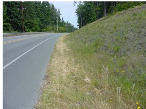
5 years after construction this location has a well established grass stand and less edge buildup than other locations, shown here recently mowed with sickle bar.

Recommendation: This treatment method should be considered most preferable for new construction in locations where grass is to be established up to the edge of pavement. It is more straightforward and less expensive than placement of compost/rock mixtures and produced the same results or better results in vegetative growth and establishment of a desirable grass stand. It