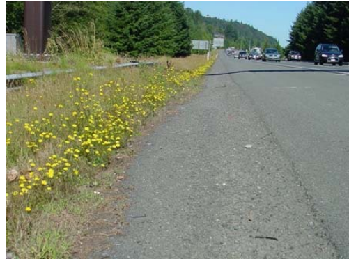
Another example of a roughened, tapering edge, this one on I-90 near Lake Sammamish, constructed 1996, shown here in 2005.