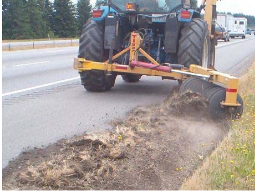
Timing on the cultivation is important. Best results were when the work was done sometime in June when most of the vegetative growth was done but soils were still somewhat damp.

alternative was first implemented. 2.) Operator practice and skill in running the cultivation arm was critical. 3.) All electrical junction boxes were located and marked the first year of implementation. 4.) All flexible guideposts/delineators were moved outside the band of cultivation prior to implementation. In the coming years the area will be evaluating the need to pre-treat with herbicide or possibly alternating between treatments with Glyphosate every two years and cultivation on the alternate years. It was also noted that some noxious weed species that had been present in Zone 1 in the area prior to implementing cultivation, were eradicated.