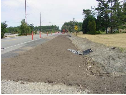
Topsoil placed during construction was subject to erosion due to the fine particles in soil structure.