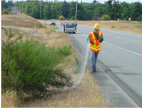
A total of 12 soil drench treatments were applied to the two mile stretch over the three year study period.

Results: The application of compost tea did not produce any noticeable or detectable enhancement of soil structure or vegetative growth.