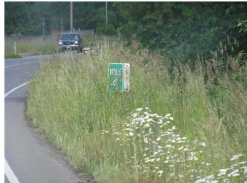
Without multiple mowing passes in the spring and early summer, grass growth in places blocks sight distance and may impact traffic safety.

Results: In the first several years after discontinuing the use of residual herbicides there were a number of sections of highway where nuisance weeds and in some cases designated noxious weeds became established and started spreading along the shoulder. However, after three to four years of mowing and treating the noxious weeds selectively with herbicides most shoulder vegetation consists of grasses. Shoulder buildup started to cause problems in a number of areas around the third year, particularly in the insides of curves and the bottoms of dips or low points in the vertical alignment. Another problem arose where taller naturally occurring grasses established at curves, corners and intersections and mowing was not able to get done until late June or July. This created places with safety hazards due to lower traffic visibility, particularly on secondary roads where there is a narrow paved shoulder.