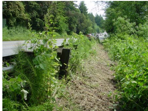
Two years after reconstruction low growing grass seeded on the shoulders and under guardrail is overgrown by weeds and blackberry vines throughout most of the highway corridor on the island.

Recommendation: This construction technique for seeding low growing grasses on the shoulder has worked well in other places. In this case there were a number of factors that detracted from success including the large quantity of tree litter and vegetation growth that resulted in rapid edge buildup, and the presence of noxious weed species on the adjacent roadside which were allowed