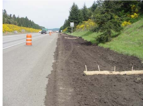
A compost blanket was added to outside shoulders and median for enhanced stormwater management and pollution control along the section of freeway draining toward the Nisqually Delta.