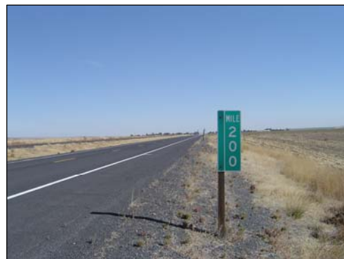
US 2, MP 200 EB, 2009, three years after bare-ground applications ceased.

Recommendations: This method of maintaining the edge of pavement should be actively considered as an alternative to traditional bare-ground applications across the eastside of the state. This site demonstrates that a selective program can be as effective as a bare-ground program while realizing a significant per mile savings. This is particularly true if the near zone 2 is infested with designate weeds that require regular treatment. This allows the applicator to simply widen the band width application to include the former bare-ground zone.