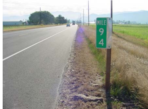
Where annual applications were skipped in certain years and locations, grasses became established. The presence of vegetation, even if dead tended to make subsequent applications less effective, because herbicide was tied up in organic matter on the surface. Also, even dead vegetation at the pavement edge contributes to edge buildup.

Recommendation: If this type of treatment is to be used, it is critical that the starting condition is a clean gravel shoulder. If this type of treatment is decided to be applied in a condition where a vegetated shoulder exists, the grass mat should be removed with grading prior to initiation of a soil residual herbicide treatment program. It is recommended that each area evaluate their shoulders and pavement edge objectives throughout the area and set goals for reclaiming and treating vegetation-free Zone 1 sections where appropriate. This approach can be planned and applied through the area IVM plans and the annual planning cycle to annually adjust how this process unfolds.