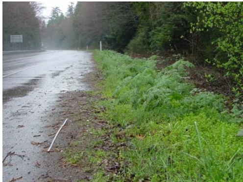
Although this image does not show guardrail it does the amount of debris that accumulates on the shoulder and the amount of weed growth two years after shoulder reconstruction.

Results: One of the greatest challenges on Bainbridge Island in this case was the fact that over the past 10 years a number of weed species have become established along the highway. This is mostly a result of insufficient resources to control the unwanted vegetation without the use of herbicides. When the new shoulders were constructed and seeded, weed seed from the adjacent roadside was deposited into the new shoulder soil with the grass seed and came up fairly thick in the years following construction. Treatment of these species required the use of broadleaf herbicides and after two years, some weeds are still persisting. Also, due to the high traffic volumes on this highway and large amounts of vegetative debris from surrounding trees, edge buildup began impeding surface drainage within two years after construction, particularly around the bases of guardrail.