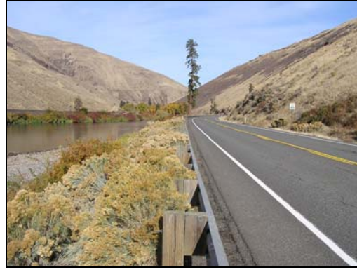
SR 821 MP 21.10, fall of 2009, rabbit brush dominates the old bare-ground zone at the edge of pavement

Results: Native vegetation began migrating into the site earlier than anticipated considering the chemical history and arid climate. The first species to colonize the site was rabbit brush, cheat grass and several invasive weeds. Rabbit brush is a woody shrub native to this area, while it is not a species we would plant in this location it can be tolerated and in most cases is beneficial in terms of weed control. At some point it will be necessary to remove the rabbit brush and any other large woody vegetation either chemically or manually. Native perennial grasses have begun to slowly colonize the site as well as several forbs. The combination of shrubs, grass, forbs and cheat-grass appears to have reduced the growing potential of a number of invasive species on site. No maintenance was necessary on this section of guardrail during this test so no input was received as far as vegetation creating problems for maintenance activities.