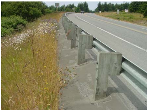
On the north end of Whidbey Island the same product was installed by a contractor along with a new section of guardrail in 2006. At the time this photo was taken in June of 2009 it appears to be holding up well without maintenance attention.

In contrast with this location is an installation on the north end of Whidbey Island that was not monitored as part of the study. In that case WeedEnder was installed by a contractor along with a new section of guardrail. The micro-climate on the north end of the island is significantly drier and there are no overhanging or surrounding trees, also the slope away from the pavement is significant. After three years the North Whidbey site appears to be holding up well and not experiencing the same problem as on the site on the south end of the island.