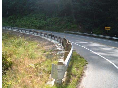
These pictures, taken at the same time three years after installation show the difference in accumulation of debris between inside corner with curb on the edge of pavement and the outside corner.