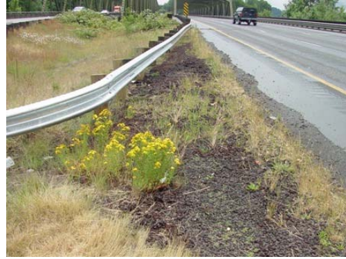
By the fourth year after installation grasses and some weeds cover approximately half the surface of the treated area.

Recommendation: The Company promoting and selling this product is no longer installing Turboscape as a roadside treatment.