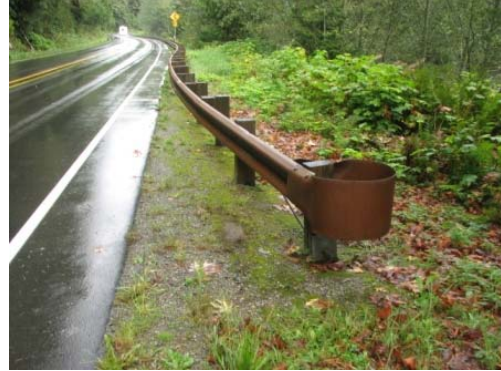
Three years after installation the mat is buried in sand and debris. Vegetation is beginning to establish over the top of the mat but growth is inhibited.

Recommendation: This installation failed due to the lack of adequate preparation and removal of existing live vegetative roots and viable seed. If installations are to be made in situations like this where products are placed around existing rail, all plant material should be treated with herbicide to ensure no re-growth occurs around the seams.