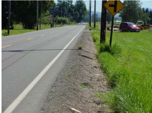
Locations where accurately applied annual applications were made, Zone 1 remained vegetation-free.

from vegetation free shoulders to vegetated, and in some cases weed infested shoulders.