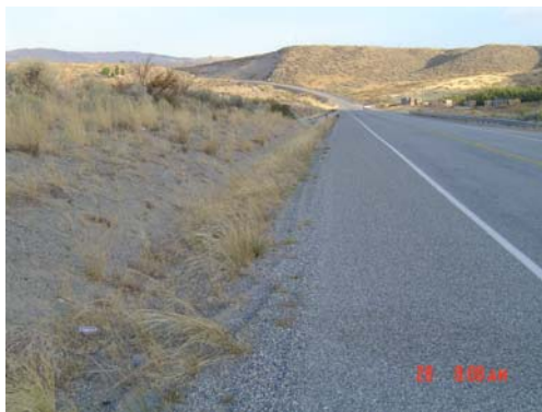
SR 17 Southbound, MP 143, summer 2009 maintained with selective herbicides only.

Cheat grass was one of the first species to migrate into the old bare-ground zone, while this isn't a desirable species it is better than many of the noxious weeds we expected. We believe that the cheat grass was at least helpful in reducing kochia, Russian thistle and other noxious weeds. Sand dropseed ( Sporobolus cryptandrus ) began to appear in 2007 as well, particularly at the edge of pavement. This species has continued to move out and is slowly filling in. Several other species have appeared in smaller quantities including Sandberg bluegrass ( Poa secunda ) as well as several wheatgrass species. It should be noted that while both sides of the roadway provided adequate weed control the Southbound side did look a little more unkempt when compared to the traditional bare-ground option. This appears to only be an aesthetic issue and did not cause any operational issues during the duration of this test.