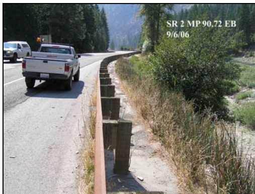
US-2, 2006 two years after installation

Results: WeedEnder Weed matting continues to function well on this test plot. This test plot location has subjected this product to a variety of weather conditions not encountered on other sites. These conditions include a substantial amount of snow and ice and related de-icing and snow removal. While no maintenance was required throughout the duration of this test plot, minor maintenance on several seams should occur within the next 12 months. Installation of the WeedEnder mats appeared to be more difficult to retrofit to existing guardrail than Traffic mats but have comparable overall performance in terms of weed control as well as some potential advantages including fire resistance the ability for water to filter through the material.