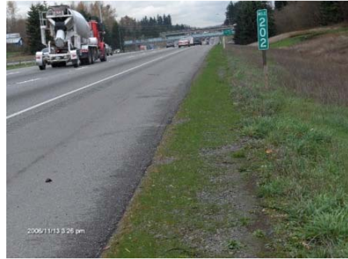
By the fall a light grass stand begins to emerge in the cultivated area. As long as the area is cultivated annually this grass doesn't cause problems, but if it becomes well established will cause the cultivated soil to clump.

Recommendation: Compared with all other alternatives tested in this study, this approach has some advantages. However, the Everett maintenance area is still refining the method and other areas are just beginning to apply it on corridors where it may be practical. Ideally the use of cultivation and repacking could be used in place of complete regrading and removal of excess material if used in some combination with chemical treatment, to create a vegetation-free or sparsely vegetated pavement edge condition in Western Washington.