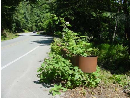
Without the use of herbicides, vegetation re-growth completely covers the guardrail every year.

Results: Several factors make this method of trimming a challenge in this area. The elevation tends to force vegetative growth later into the summer months and the plant community in the area favors a number of species of larger forbs and typically periodic rain throughout the summer results in abundant growth. The terrain around guardrail installations often drops sharply from the edge of the road making access difficult and hazardous. Use of corrections crews to do this work is cost effective and relatively efficient. However, corrections crews are not always available when needed, in which case the work must be done by WSDOT maintenance technicians.