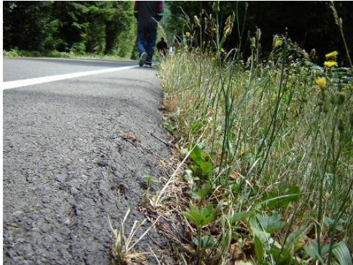
In the study site on SR 410 in the Mt. Rainier National Park the safety edge is bordered by a grass shoulder. Shown here in the second year after construction.