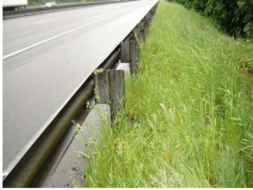
Even in late June prior to mowing this roadside is completely functional.