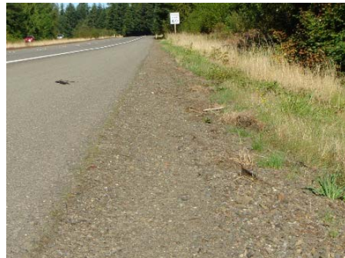
In other locations the shoulder has remained vegetation free until the following fall when some re-growth typically occurs.

Results: This corridor did not look as clean as the sections on I-5, due to the differing slopes off the shoulder and clumps from grass growth in the cultivated zone. Also, productivity was less than that achieved in Everett. However, the results in terms of even transition between paved and non-paved shoulder and eliminating any problems associated with edge buildup and drainage make this a viable alternative. In coming years the area will continue to evaluate condition