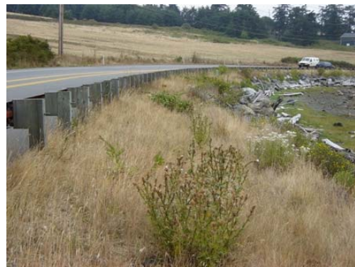
The only roadside maintenance at this site is some selective control of unwanted vegetation is needed.

Recommendation: If naturally occurring low growing grasses are present in an area or if they can be successfully established through seeding following construction or under guardrail cleaning, this is a viable option and the lowest overall under guardrail treatment. It would also be advantageous where low growing grasses can be established, to combine this type of treatment with an angled pavement edge design to help alleviate issues with edge buildup.