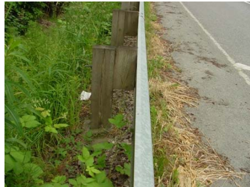
Photo taken in June of 2009, seven years after installation and before annual cleaning is done.

In contrast with this location is an installation on the north end of Whidbey Island that was not monitored as part of the study. In that case WeedEnder was installed by a contractor along with a new section of guardrail. The micro-climate on the north end of the island is significantly drier and there are no overhanging or surrounding trees, also the slope away from the pavement is significant. After three years the North Whidbey site appears to be holding up well and not experiencing the same problem as on the site on the south end of the island.