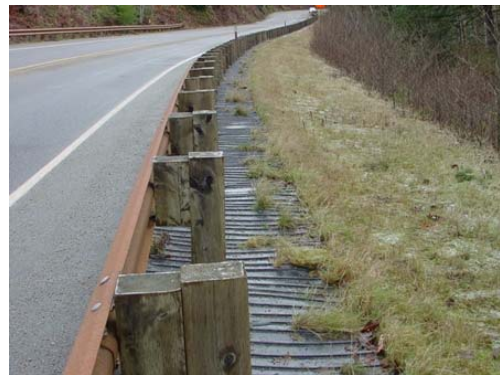
Grass came through where the panels joined together and where the material cracked.