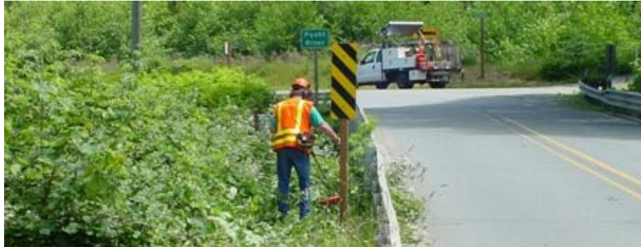
Trimming vegetation around guardrails manually is time consuming and exposes maintenance workers to traffic and tripping hazards.

significantly more expensive and labor intensive than mowing on shoulders without guardrail.