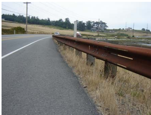
Native grasses in this area are sparse and low growing, requiring virtually no maintenance.

Results: This is a rare case in Western Washington where no vegetation maintenance is required around the base of guardrail other than occasional selective weed control. The presence of native low growing grasses in this location is due to the dry micro-climate and proximity to the saltwater beach. If it were possible to establish a stable grass stand with low growing grasses in locations such as this there may possibilities of doing this in other locations such as was tested in case 1.21.