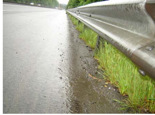
Buildup under the rail has not been cleaned since construction and is still not causing any problems as of the end of the study period.

Recommendation: This design configuration, running the pavement out to the face of the guardrail posts appears to offer a way to reduce the width if not eliminate the need to maintain a bare-ground strip. The area will continue to monitor this location for edge buildup. Mowing could be eliminated altogether in this location and selective herbicides used as need to further reduce cost/mile. Other locations throughout Western Washington with similar design configurations should be evaluated for treatment as conducted in this case.