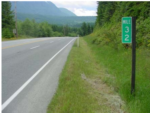
Not only the pavement edge, but the entire right of way along this corridor is a model of consistent IVM application over time. The result is a high level of service at the lowest life-cycle cost.

Results: This is perhaps the best example in Western Washington where maintenance has adapted and transitioned from a vegetation-free edge to a healthy grass stand. Shoulder buildup has not been an issue, being controlled incidental to winter plowing and sweeping operations. More frequent mowing also seems to contribute in minimizing edge buildup. Cost including two mowing cycles with the truck mounted boom mower is still only half the cost of other locations being mowed once annually using a tractor mounted drop-down side mower. Use of the truck mounted mower also allows the crew to do selective trimming as needed to control vegetation in Zone 2 beyond the pavement edge.