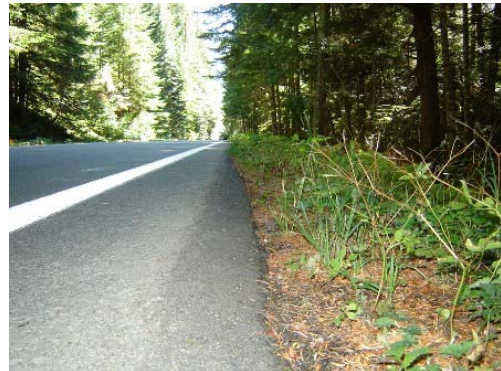
During the three year study period, buildup occurred in some places, such as insides of curves, but much of the edge is still free draining five years after construction.

Results: This appears to be an effective treatment for pavement edge in new construction or in situations where a new layer of asphalt is being overlaid in resurfacing projects. This type of edge can be constructed with no additional cost by attaching a shoe to pack the edge at the desired angle in conjunction with the finished paving operation.