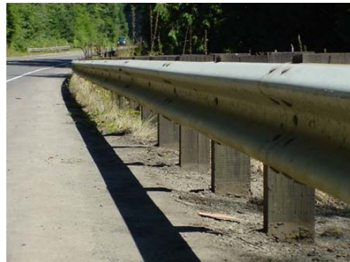
Vegetation and buildup under guardrail has been removed manually on a three year cycle since herbicide use was discontinued in the early 1990's.