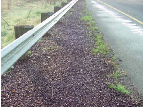
In the first year following installation, grasses are already beginning to establish.