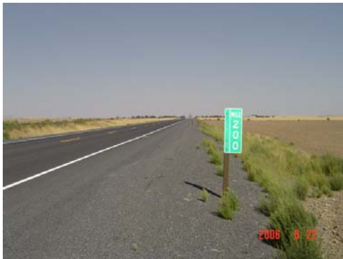
US 2, MP 200 EB, 2006

Overall regeneration of desirable species has been slower than anticipated. This is most likely due to a number of factors including low organic matter in the roadside soil, low rain fall and slow degradation of residual chemicals. While establishment of desirable vegetation has been very slow, it does appear to be making steady gains. The full transition from bare-ground to established desirable vegetation at the edge of pavement will likely continue for at least another 2-3 years. This test plot indicates that in this situation the transition while slow can meet roadside maintenance needs at a cost that is lower than the traditional bare-ground treatment. As establishment of desirable vegetation continues vegetation maintenance costs, should continue to improve.