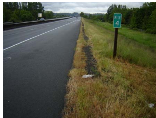
By the end of the study period six years after construction, the strip of compacted grindings is over 50% grass cover. Grass establishment could be prevented with Glyphosate treatments on a 2 to 3 year or as needed basis.

Results: This edge held as mostly vegetation-free for three or four years before grasses began establishing. A periodic treatment with Glyphosate, administered just as the grasses start to emerge would likely keep the strip mostly vegetation-free. This detail and method of construction could be considered for any project with pavement grinding as part of the process.