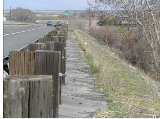
Photo taken in 2009

Recommendation: While the cost per mile is extremely high, this product may have applications on WSDOT right of way in specific locations, such as highly sensitive areas where chemicals are not an option. Installation costs should be substantially lower than recorded in this study if installation occurs during new roadway construction instead of as a retrofit to existing guardrail. Of the three matting products that were evaluated Traffix weed matting was the easiest to retrofit of the three. However, it is likely even with experience and training that retrofit costs could decline enough to make this a viable option for retrofitting of WSDOT guardrail.