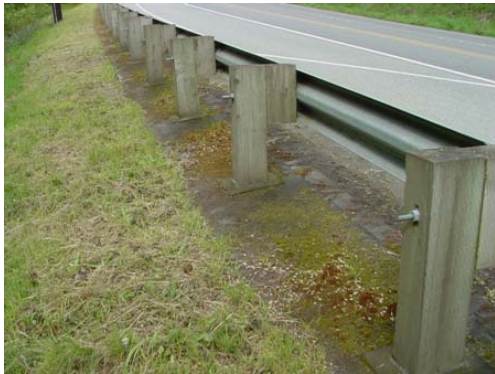
At about 5 years after installation in this case, moss growth became a significant factor. Moss in combination with debris from falling leaves and cut grass and brush serves as a seed bed unless annual cleaning is done.

buildup of debris on top of the mat. In this location annual cleaning is required to keep the mat from getting buried and overgrown. Of course debris buildup will occur over time regardless of the presence of a weed barrier, but if installation costs are included along with annual cleaning costs in a case such as this, the life-cycle cost is significantly higher as compared to treatment with annual residual herbicide application and removal of buildup as needed typically on a 7 to 10 year cycle. There is also a question on the life expectancy of this product. The manufacturer currently guarantees the product for 15 years.