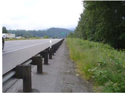
Photo taken after the pavement was cleaned off in the spring of 2008.

Results: Due to the heavy traffic volume at this location, dirt and debris accumulate more rapidly in this location as compared to the SR 105 site. Surface of the pavement is angled down at the outside edge which helps direct debris out from under the rail, but significant accumulation still results in the entire paved area under and behind the rail being completely covered and growing vegetation within 5 years after cleaning.