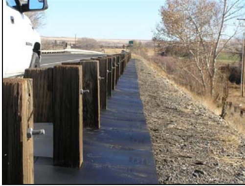
Immediately following installation in 2006