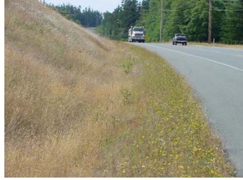
Over 4 years most of the shoulders along SR525 have evolved into grasses and perennial nuisance weeds such as smooth catsear and occasional patches of scotch broom, tansy and knapweed.

With snow on the island in winter of 2009, double rubber bit plow was used and by running the edge just off the pavement, some buildup was removed. Sweeping 4 to 6 times per year and running sweeper along the edge also helps remove/prevent buildup. However, where buildup has occurred there are low spots where water channelizes down edge and creates potential point discharge into surface water flows. The area will continue to monitor and evaluate this phenomenon in the years to come.