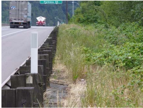
Six years since the site was last cleaned, enough dirt and debris has deposited to support a grass stand over the pavement.