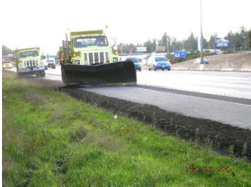
This photo shows how the operation of cultivation works. A plow truck pushes the turned material back into place and the two buffer vehicles drive over the edge, packing it back into place.

Results: Productivity with site was much lower than that in Everett resulting in a high cost per mile, however the results were comparable. Reasons cited for lower productivity were: 1. There were a number of electrical junction boxes buried on the shoulder and both years the test was being run a number of boxes were hit and repaired. 2. Guideposts/delineators were installed in the zone being cultivated and had to be worked around. 3. The crew and cultivation operator in this case was still learning and was not as efficient as the practiced hand in Everett.