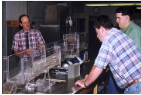
The portable hydraulic flume demonstrates the effects of various hydraulic principles.

Objectives: Upon completion of the course, participants will be able to: