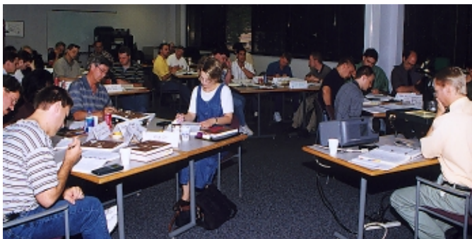
NHI course participants work on various hypothetical culvert design projects.

The target audience was engineers and technicians responsible for culvert design on transportation facilities. The course is suitable for entry level personnel and is valuable as a refresher course for those with previous culvert design training or experience.