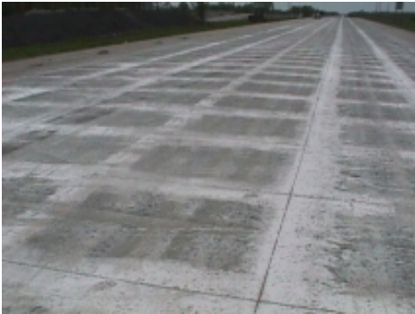
Concrete is cut in four by four foot sections.

The joints were cut four feet across the lanes and four foot transverse joints were cut throughout the length of the paving project. The saw joints were cut to a depth of three quarters of an inch. No joint filler was used