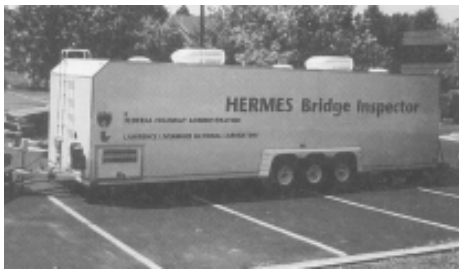
HERMES was used to inspect bridges in the St. Louis area. It is the only one of its kind and is operated by FHWA.

MoDOT's St. Louis Metro District was fortunate enough to be able to use this technology to inspect several bridges in the area last month. Bridges on Interstate 44 at 39th Street, Thurman Avenue and Tower Grove Avenue were tested. The testing equipment is located inside a van and takes a "snapshot" of the pavement at speeds of about five miles per hour. The equipment actually utilizes 64 radar antennas to recreate the image inside the bridge deck at a very high resolution. MoDOT engineers hope to discover what condition the asphalt overlay, the bridge deck and the structural steel is in. This will hopefully