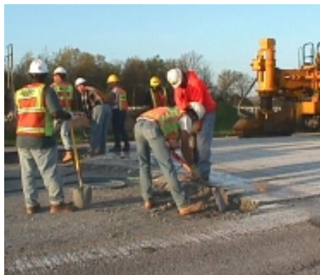
Crew preparing roadway for UTW.

The contractor milled the existing asphalt driving lanes down two inches below the driving surface. The millings were stockpiled at the Neosho maintenance facility for future use. Once the milling was completed, APAC took special care to clean the milled surface because no bonding agent was used. "The