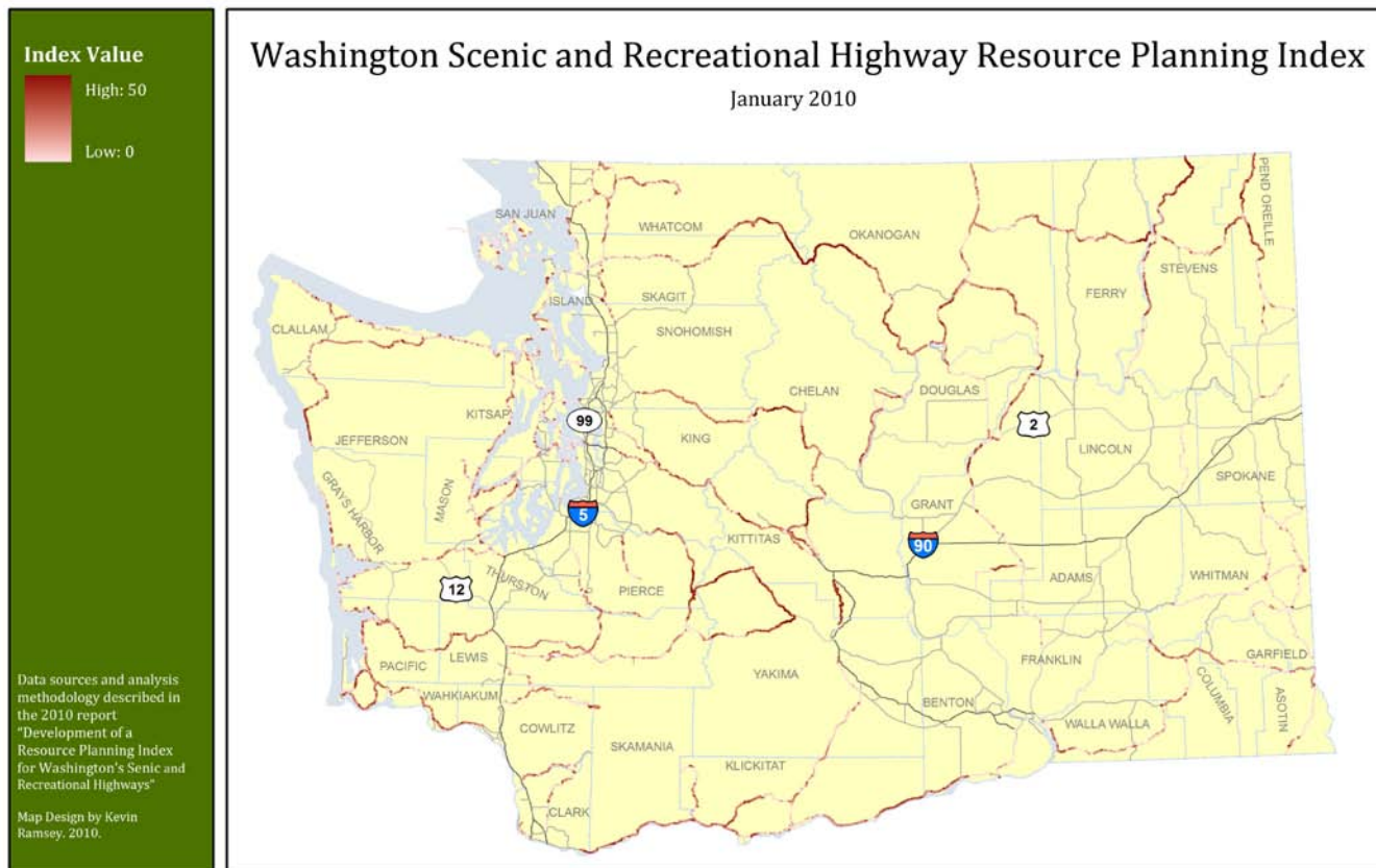
Figure 1: Resource Planning Index Values for Scenic and Recreational Highways