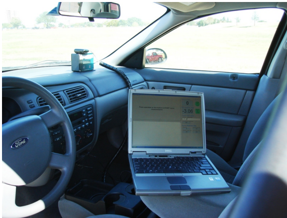
a. Equipment Setup.

The equipment used to implement the GPS Method includes a GPS receiver, an electronic ball-bank indicator, and a laptop computer. The GPS receiver serves as the curve radius and deflection angle survey instrument. The electronic ball-bank indicator is used to estimate superelevation rate. A typical equipment setup is shown in Figure 1. The GPS receiver and ball-bank indicator are shown in Figure 1b. The rectangular object mounted on the dash in the center of the figure is the ball-bank indicator. The GPS receiver is the small black object mounted on top of the ball-bank indicator.