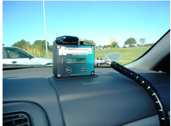
b. Measurement Devices.