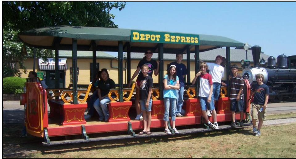
Figure B-1. 2007 GUTEP participants – week 1