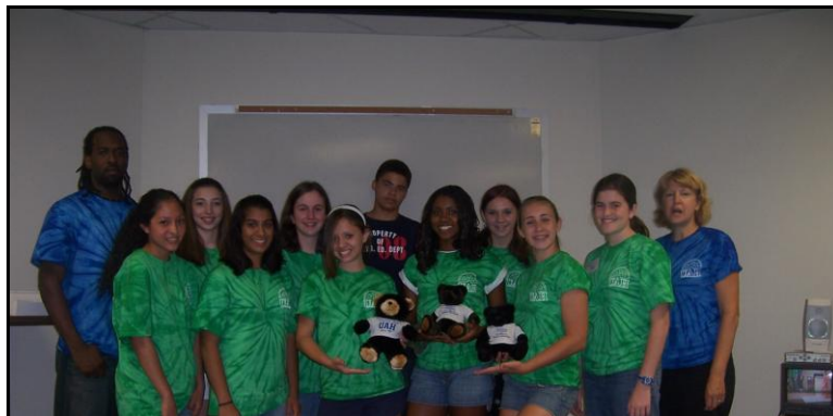
Figure B-2. 2007 GUTEP participants – week 2