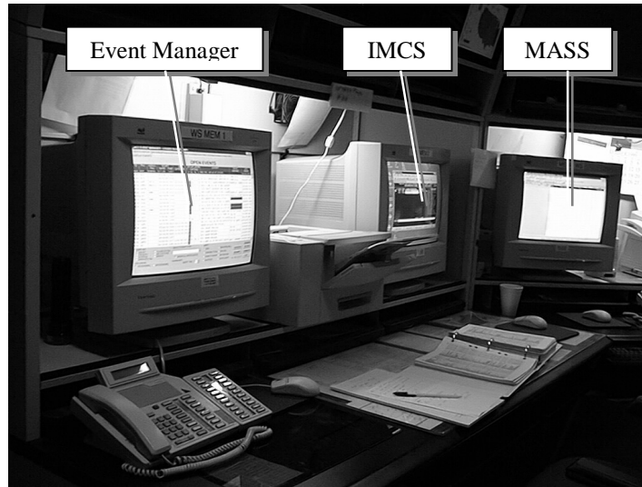
Figure 2. AF specialist workstation at Memphis MCC.