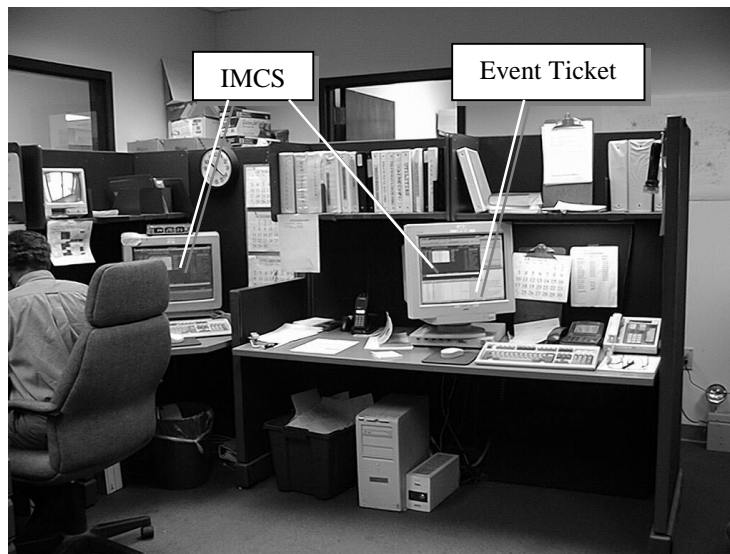
Figure 3. AF specialist workstation at Atlanta MCC.

Despite these variations, the jobs performed at fully functional MCCs are very homogenous. Systems Flow Inc. conducted a job task analysis for MCC specialists in 1994. The analysis identified 79 separate tasks that are performed by MCC specialists and the job requirements necessary to perform these tasks. Of these 79 tasks, the authors identified 7 tasks that are directly related to SA (shown in Table 1) and 7 tasks that are indirectly related to SA (shown in Table 2). The frequency of each task was estimated. High frequency tasks are performed more than five times per shift. Medium frequency tasks are performed two to five times per shift. Low frequency tasks are performed once or less per shift (Systems Flow Inc., Chapter 2, pg. 3).