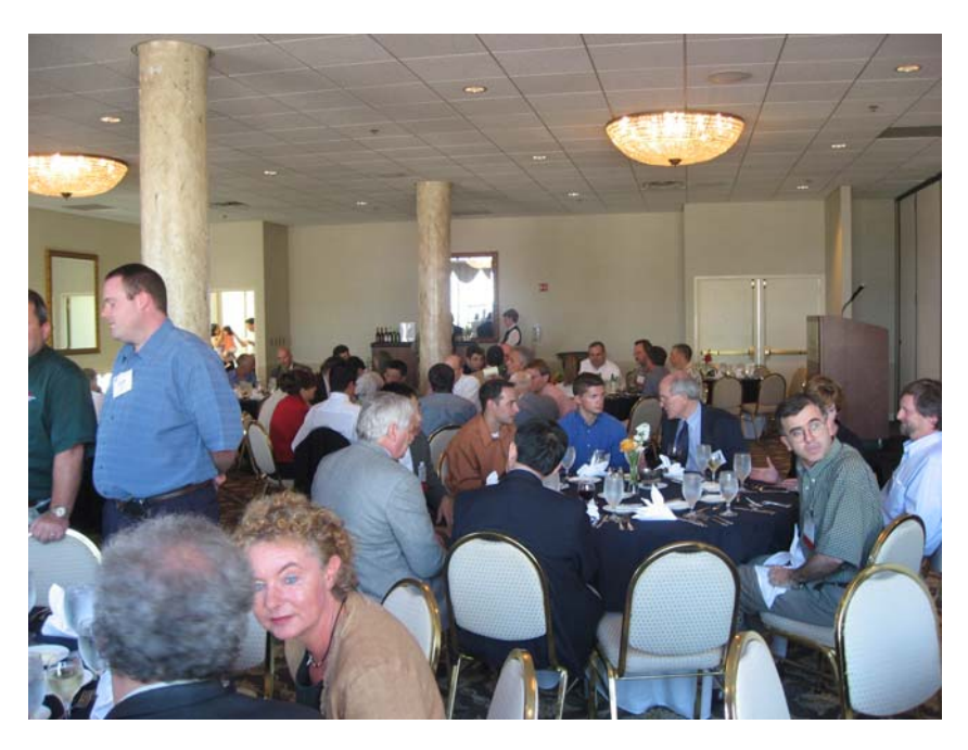
Figure 5. A mid-week banquet provided an opportunity for conference attendees to interact and exchange ideas and experiences.