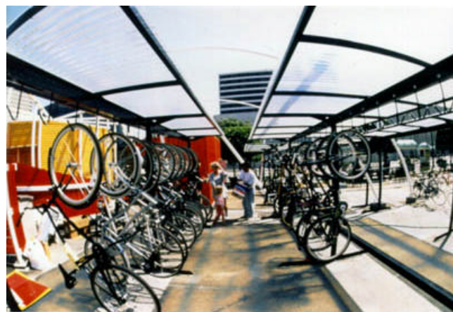
Imagen de recinto descubierto