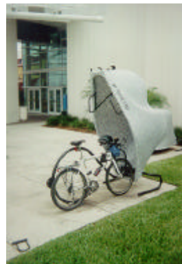
Imagen de recinto cubierto