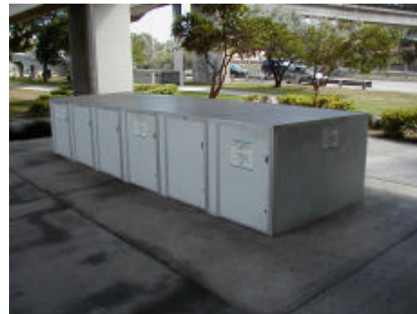
Imagen de recinto encerrado