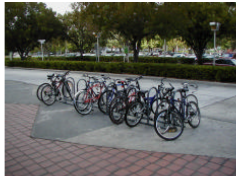
Foto Rak Bisiklèt Ki Pa Kouvri