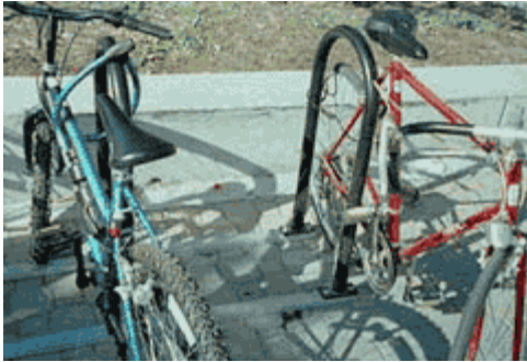
Figure 2.2: Rolling Rack