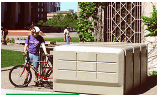
University of Minnesota