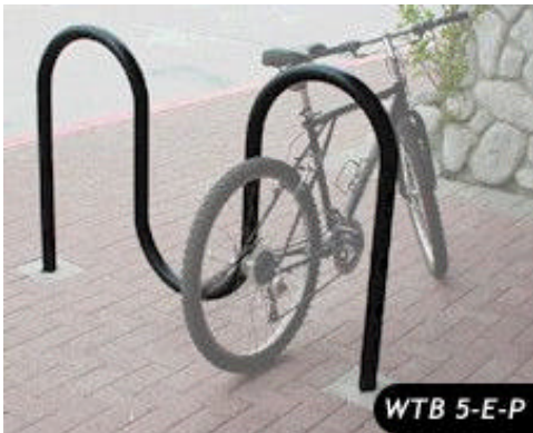
Figure 2.3: Traditional “wheel-bender” rack