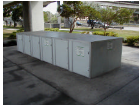
Foto kazyè Bisiklèt