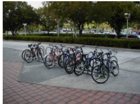
Imagen de recinto o taquilla para bicicleta

12. De los siguientes, ¿cuál preferiría usted?