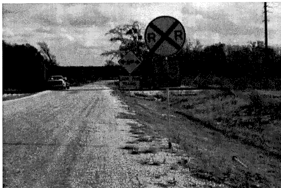
Figure 2. "LOOK FOR TRAINS" Sign System.