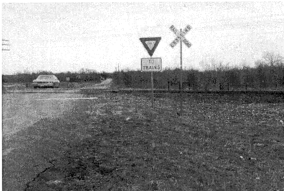
Figure 1. "YIELD TO TRAINS" Sign System.