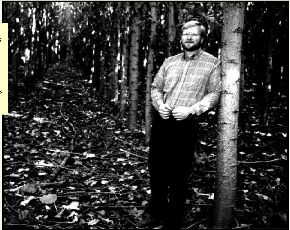
Walter Greig, NREL

Don Rice, a supervisor with James River Corporation, stands in a plantation of hybrid cottonwood trees, which make an excellent energy crop for biofuels production. This crop of trees, which will be used to make paper, is grown near Clatskanie, Oregon.