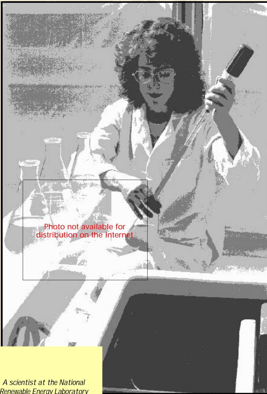
Photo not available for distribution on the Internet.

Up to 50% of the total U.S. diesel fuel consumption (amounting to 190 billion liters or 50 billion gallons in 1991) could be replaced with biodiesel made from animal, vegetable, and microalgal oils. In the 1990/1991 growing season, the United States produced approximately 10.1 billion kilograms (22.3 billion pounds) of bio-oil (soybean, corn, cottonseed, peanut, sunflower, canola, and rendered tallow). If this oil was used solely for biodiesel production, it would be equivalent to 12.1 billion liters (3.2 billion gallons) of fuel. Because several animal and vegetable oils are being displaced in the U.S. food market as a result of health issues, biodiesel from these resources could offer a high-value alternative market for U.S. oil seed and tallow producers.