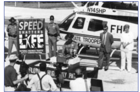
Florida kick-off event

That's right ... kind of silly, isn't it? Imagine how powerful their messages would be if they said it together. They did just that in Florida to kick-off the July 4, 1996 celebration. And they might be on the brink of a cure for the most devastating plague of all -- traffic crashes.