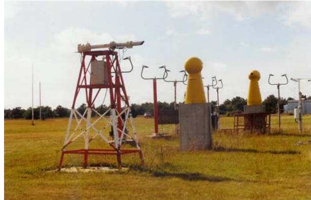
Fig. 4 – Visibility Sensors.

Visibility Sensor Development – Recent and ongoing monitoring, testing and calibration of forward scatter meters is conducted including comparisons with reference transmissometers and other forward scatter meters. A photo of forward scatter meters and reference transmissometers used in recent tests is shown in Fig. 4.