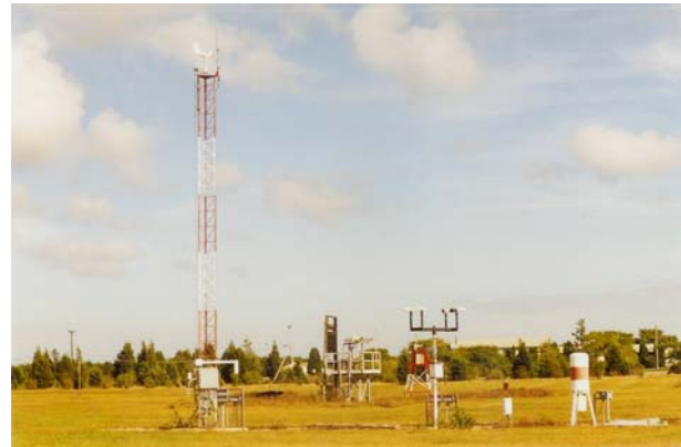
Fig. 2 – Weather Instruments at Otis WTF.

Because of the propensity of the site to experience many instances of low visibility throughout the year, the WTF's 155 acres of flat land and instrumented towers have been ideal for both near-surface and slant range visibility testing.