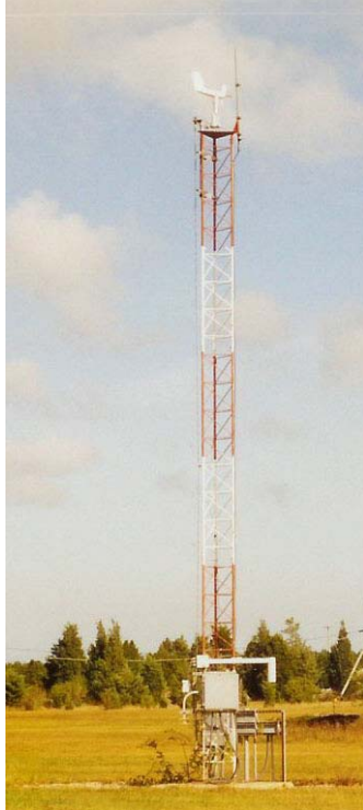
Fig. 5 – Anemometer Atop Tower.